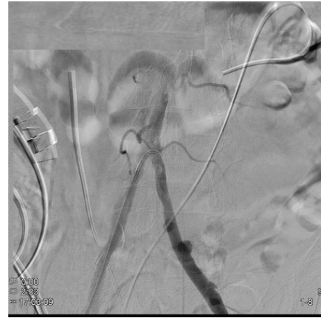
FIGURE 2: Patient angiogram demonstrating multiple areas of ruptured plaque and extravasation on the left common iliac artery.

Approximately four months after the endovascular stent placements a MAG 3 renal scan showed reduced left renal function (14%). Given the continued presence of the bilateral ureteral stents and the newly added vascular stents, there was concern for further erosion and fistula formation. The patient subsequently underwent open correction at which time the bilateral ureters were found to be densely adhered to the common iliac arteries. Successful dissection of each ureter was completed enabling left nephroureterectomy and resection of the right distal strictured ureter with revision of the ureteral-intestinal anastomosis. The right ureter has, after revision, remained patent with no strictures. She has been healthy since that time and has not required any further urological interventions.