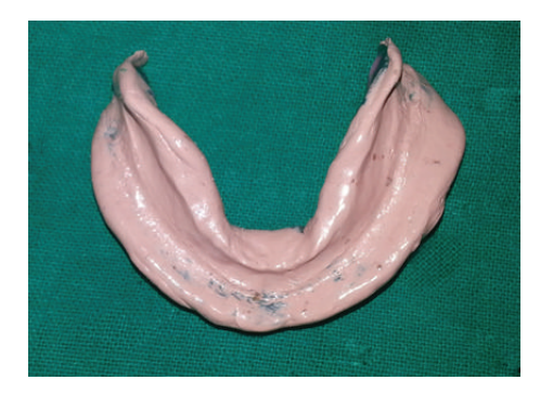
FIGURE 2: Conventional technique.

In the second technique, mandibular secondary impression was made using McCord and Tyson's admixed technique [6] for flat mandibular ridges. Impression compound ( DPI Pinnacle, The Bombay Burmah Trading) and green tracing stick compound in the ratio of 3:7 parts by weight are placed