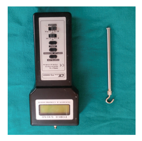
FIGURE 8: Digital force measurement gauge.

with the occlusal plane parallel to the floor and the digital force measurement gauge (digital force gauge device model 47544, Extech Instruments Corporation) held in the palm of the hand (Figure 10). This force was measured in Newton and recorded as the denture's retention. Readings were recorded and the collected data was tabulated to evaluate and compare retention of the dentures fabricated using various techniques (conventional, admixed, putty rubber base and light body final wash, functional, cocktail, and all green). The retention of mandibular dentures was also evaluated clinically, and the patient was requested to comment on the retention of each mandibular denture.