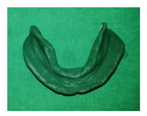
FIGURE 4: All green technique.