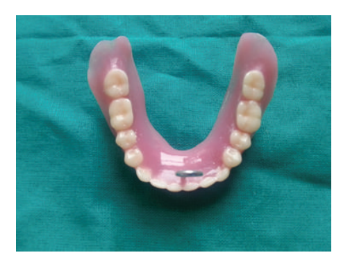
FIGURE 9: Denture with retention hook.

The success of every complete denture relies on the fulfilment of the three basic properties of retention, stability, and support. Mandibular dentures usually present more difficulties in achieving these three properties, basically because of the larger number of anatomic limitations that requires added attention. The retention of the dentures is influenced by the factors like cohesion, adhesion, fluid, viscosity, atmospheric