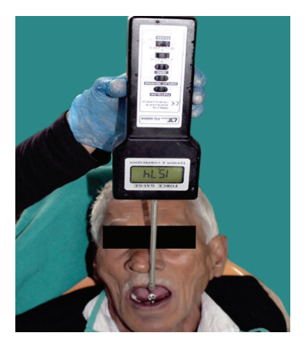
FIGURE 10: Patient with retention appliance.

pressure, external factors arising out of oral-facial musculature, and occlusion (Murray & Darvell 1993; Shay 1997). The accuracy of complete denture impression techniques has been debated for many years. A wide diversity of denture border outlines, resulting from the use of the same impression procedure for all patients, has been shown and documented [15]. Numbers of impression techniques have been described in the literature for resorbed mandibular ridge [4, 16, 17]; each technique has its own advantages and disadvantages.