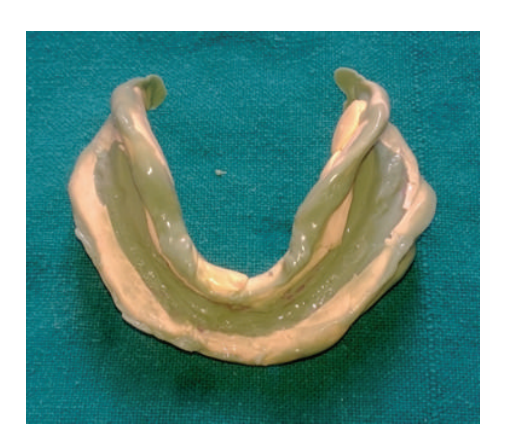
FIGURE 7: Elastomeric technique.

while the light-body impression material is border molded along the buccal and labial flange areas. After the material has set, the impression was removed from the mouth and examined for any discrepancy (Figure 7).