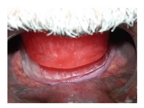
FIGURE 5: Functional technique.