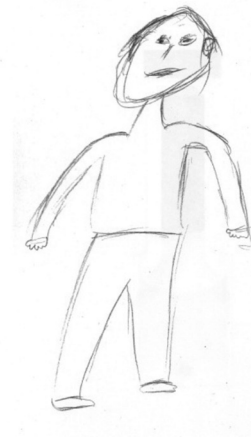
FIGURE 1. Aaron's man

Draw the Person. He draws the figure of the person with a suitable size. The figure is not too small and not too big according to the size of the paper. He placed it in the center of the page. The lines are entangled. He draws the shape of the figure, especially the head with more than one line. It is not looking for eye contact. It seems that the figure makes a vague step with his left foot.