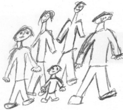
FIGURE 4. Aaron's family