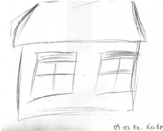
FIGURE 2. Aaron's house

Draw the House. The drawing of the house is schematic. The lines are also entangled. The house is not symmetrical.