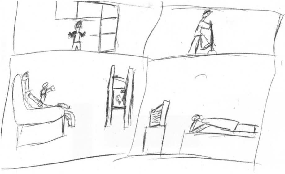
FIGURE 6. Aaron's kinetic family