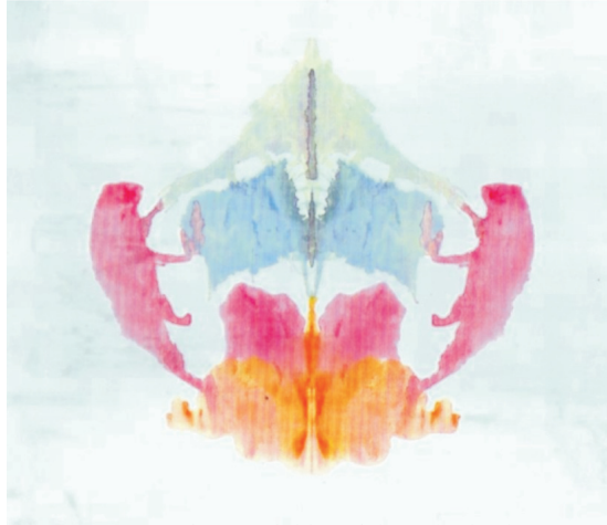
FIGURE 8. The VIIIth blot of the Rorschach Test

on the right, one on and the left side of the page, compress the butterfly with their hind legs, prevented him going away”.