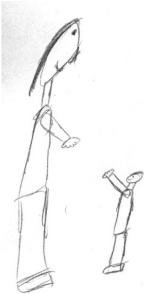
FIGURE 7. Aaron's mother – child drawing

The task is: to draw a mother with her child. This drawing points out the characteristic of the relationship between mother and her child. In the picture they reach for each other but they are not attained each other.