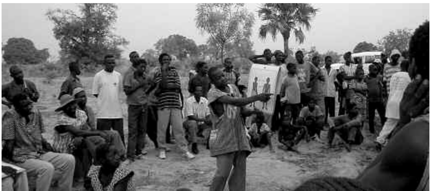
A lesson on river blindness and the correct use of Mectizan to treat it in an African village.

Exposing Merck to the risks of decisions by unproven lay health workers, including improper dosing and reporting, black market diversion, and a lack of professional oversight, seemed too much for Fettig and Colatrella to even consider. As it turned out, their fears weren’t totally unfounded. A few years after CDT began, Mectizan would be linked to a rare death in Cameroon where no medical professionals were present to intervene. “As corporate decision makers, we wanted proof that CDT could work” without incurring such risks, Fettig explains. But of course, for all of the WHO’s extensive research into the concept, “No one could give any