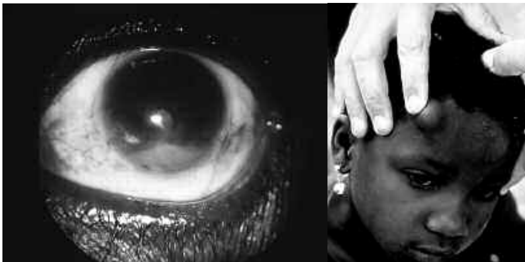
Eye lesions (left) and skin nodules (right) are symptoms of river blindness.

Yet, for all of the partnership's acclaim, Merck's uncharted journey with the WHO, along with the World Bank and dozens of NGOs and national health ministries, has given rise to a number of conflicts over the last 18 years that could just as easily have shut the program down. How these organizations with radically different experience and motivations found common ground over controversial issues such as CDT is a study in the fragile balance of power sharing. As in any strong partnership, the success of the MDP is rooted in the art of knowing when to exert, cede, or com-