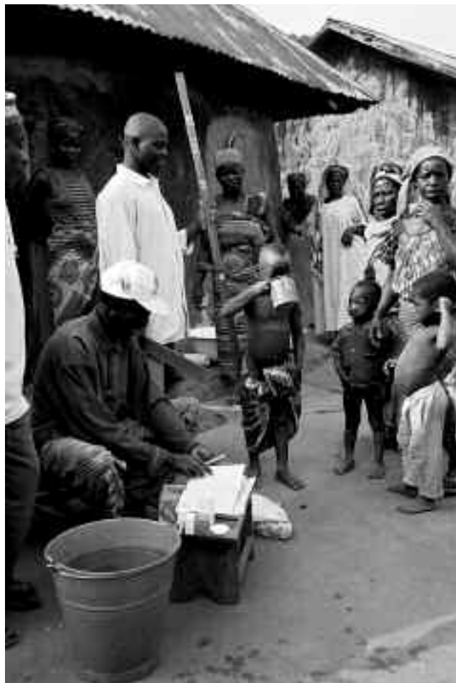
Local health workers distribute Mectizan in a village in Togo.