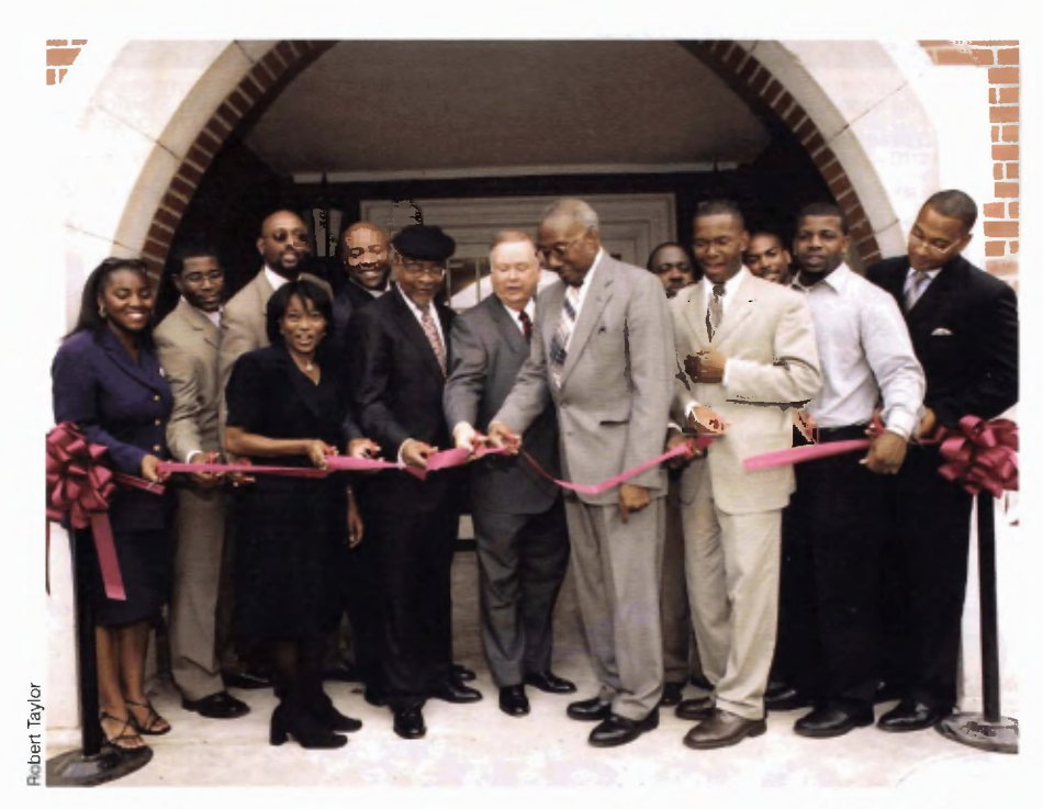
Members of OU's black community gather at the site of the former Stovail Museum for the dedication of the Henderson-Tolson Cultural Center, the naming of which honors the two men most prominent in the support of OU's black students over the past four decades.

Tolson clearly takes great delight in recounting a family story involving music.