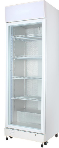
HUS C500 - AHT

A glass one-door cooler that includes a no frost cooling system, self-closing double-glazed doors, full length LED lights and a self-evaporating drip tray.