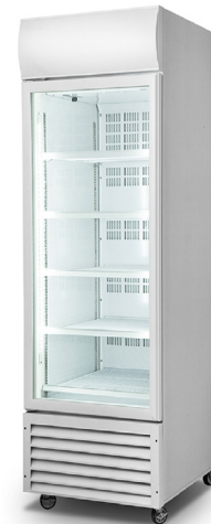
AQ ME S6A - AVEM QUIRKS

If you want to showcase your products in front of house or reclaiming floor space as a storage outback, it will be easy for your clients and staff to find exactly what they are looking for. This new glass one door chiller combines modern engineering with modern design, keeping products at an optimum temperature and providing market leading energy savings along with new features to deliver optimal performance, efficiency and reliability.