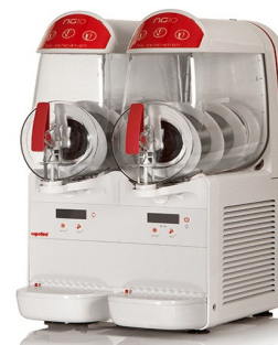
NG 10/2 - UGOLINI