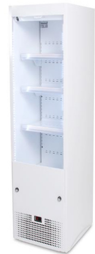
AVO STD - ASTE

Ambient Rating : 32° Power Supply : 10 amp