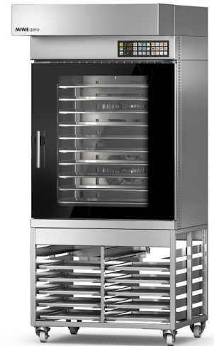
AERO AE 10 (600 x 400) - MIWE