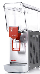
ARTIC DELUXE 12/1 - UGOLINI