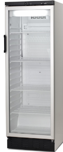
FKG 311 - VESTFROST

Ambient Rating : 32° Power Supply : 10 amp