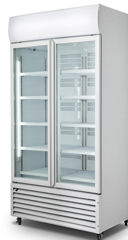
AQ ME D10A - AVEM QUIRKS

Providing the same functionality as the AQ ME S6A, this new glass two door chiller combines modern engineering with modern design, keeping products at an optimum temperature and providing market leading energy savings along with new features to deliver optimal performance, efficiency and reliability. This unit is a functional unit ideal for showcasing your products in front of house or reclaiming floor space as a storage outback.