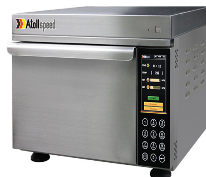
300T - ATOLLSPEED

A hybrid oven that combines hot air, impingement and microwave heating. Perfect browning and crisping is guaranteed in a very short time due to adjustable impingement heating. Up to 10x quicker than conventional cooking, this unit is perfect for the snack-business. The newly developed touch screen controls are easy to use. Programs are simply chosen via icons and the baking can begin.