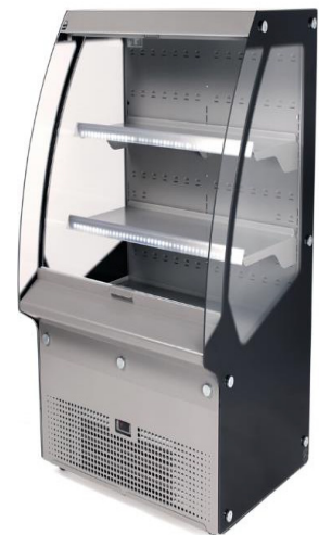
AVO HARMONY 135- 60 - ASTE