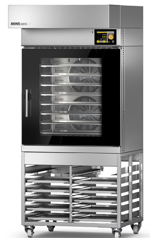
AERO AE 08 (600 x 400) - MIWE