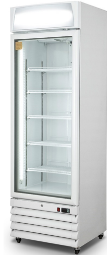
AQ FD LD57 - AVEM QUIRKS

Our one door glass commercial upright freezer is ideal for Restaurants, Cafes, Bars, Clubs, Pubs, and has even been installed around Australia. With 5 adjustable shelves our freezer offers 360 litres of storage capacity. Our units come equipped with wheels installed. Self-closing glass doors ensures the contents remain cool and fresh even in busy kitchen. Frost Free with Automated Defrosting System.