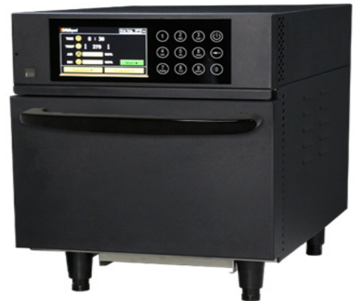
300H - ATOLLSPEED