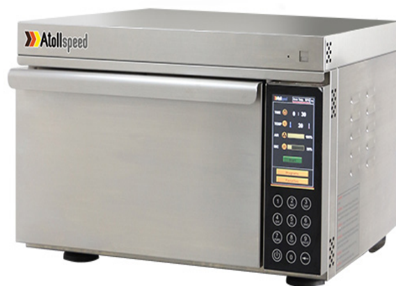
400T - ATOLLSPEED