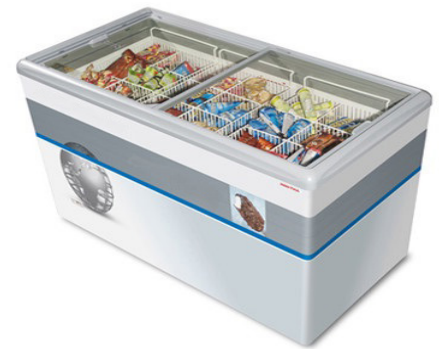
RIO H - AHT

Designed to sell more ice-cream by being visually appealing. Offering two different models: slanted with curved glass sliding lids and horizontal with flat glass sliding lids or solid lids permit perfect merchandise presentation and excellent visibility. Available in 1000mm, 1500mm or 1750mm.