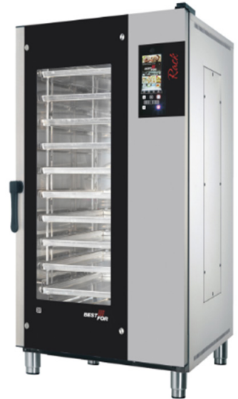
BISTROT RACK - BOA

Auto clean washing system, Various cooking ( convection, steam, mixed), Vision touch control, Recipe, chef and manual mode USB connection- import and export programs , import new recipes from the Web, Programmable, Automatic washing system with sanitizing system ( 3 programs ), Trays 400 x 600, Led light, Rounded baking Chamber, Double glass, Pipe steam system, auto reverse fans, Condensation collection basins, Stackable.