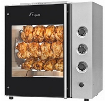
TDR 5 MANUAL - FRIJADO

Controls with manual settings, Set time, temperature and start of the rotisserie, Efficient heat transfer reduces energy consumption.