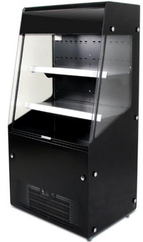
AVO HARMONY 145- 87 - ASTE

AVO product family consists of impulse coolers that can be placed on shelf, table or floor. They give you an easy solution for different locations to be used together or separately. The exterior of AVO products can be customized to your brand to give it the possible presentation.