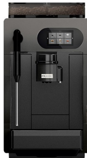
A 200 MS - FRANKE