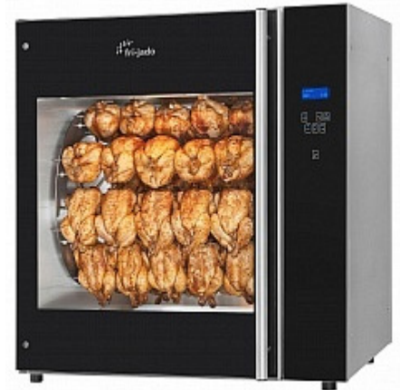
TDR 5 PR - FRIJADO