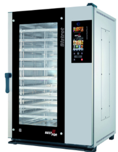
BISTROT STAR 1065 - BOA