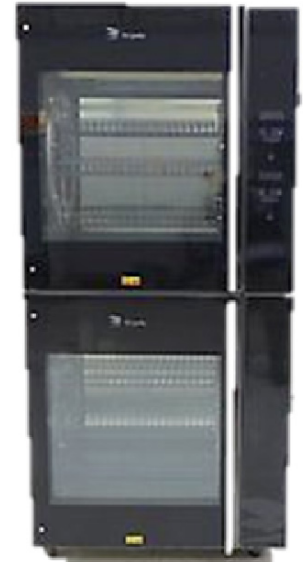
STACKABLE - FRIJADO