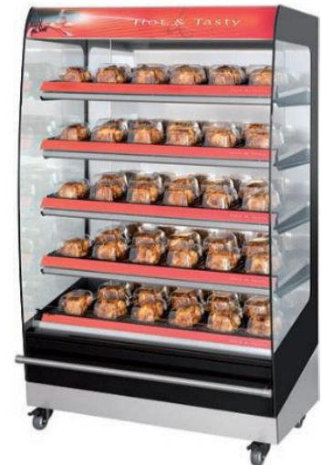
MD 5 LVL 120 - FRIJADO

Self Serve heated merchandisers, ideal near checkouts. Innovative airflow technology: no hot or cold spots. Boost Impulse sales, Upright design save space. Cross merchandising capabilities, Power Supply 10 amp.