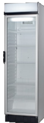
FKG 410 - VESTFROST

Ambient Rating : 32° Power Supply : 10 amp