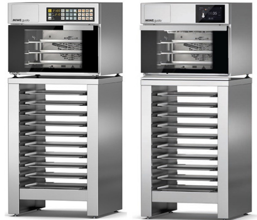
GUSTO GU 3/SNACK (440X350) - MIWE