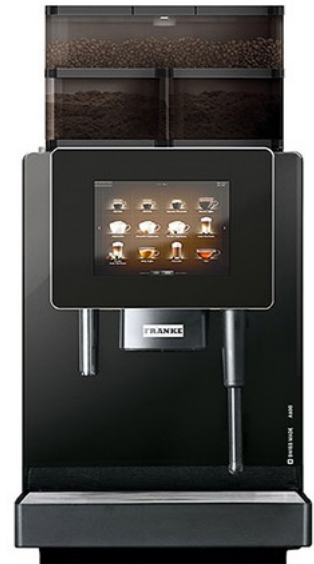
A 600 - FRANKE

Maximum energy efficiency thanks to a timer function and minimal power consumption in standby mode, Selection from three different brewing units – optimally adjusted to your way of making coffee, Crystal clear, intuitively operated display, Functional lighting concept, Generously sized bean hopper for simple refilling (2 x 1.2 or 1 x 2 kg), One coffee grinder, Fresh milk for milk foam (hot & cold), Touch screen display, Automatic cleaning and rinsing, Power supply 230V, 2.8kW, 15A.