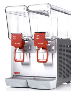
ARTIC DELUXE 12/2 - UGOLINI