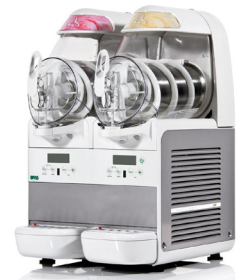
B-CREAM 2LK - UGOLINI

Optimal design for better product storage Water drip collection system. Graphic display showing a larger number of messages, User friendly keyboard, Sensor which perceives the presence of the cup for ease of dispensing, Easily replaceable graphics, Lockable faucet, Bowl fixing system.