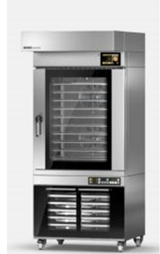
ECONO EC 10 (600 x 400) - MIWE with optional proofer

Electric convection oven ideal for interrupted baking of Danish-style pastries and croissants. Perfect for the convenience sector due to a wide range of clever functions and easy to use interface. Comes in 4, 6, 8 & 10 trays. Also with MIWE flexbake, this makes the Econo a learning oven, adapting baking programs per trays loaded into oven.