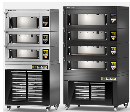
CONDO 06.04 / 08.06 - MIWE with optional proofer