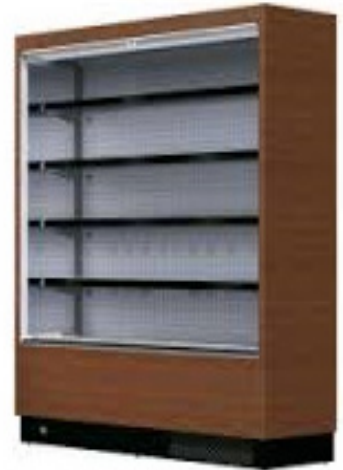
FILIP 400 - PASTORKALT

FILIP – A wall display cabinet with integrated cooling unit (plug in) is designed for sale of all food products assortment. It is suitable for shops of all sizes due to a wide range of lengths, the strict design, clear lines, customisation or integrating to a specific shop interior. Canopy lighting and end walls lighting ensures maximum visibility of displayed food products. There is the possibility to install glass door if required. RB version is suitable for back counter displays. Available in three lengths 1275 (519 ltr) 1875 (788 ltr) and 2500 (1058 ltr).