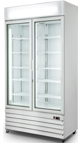
AQ FD LS122 - AVEM QUIRKS

Fundamental to keeping products fresher and tastier for longer, our two door glass commercial upright freezer is ideal for Restaurants, Cafes, Bars, Clubs, Pubs, and is certain to cater to all of your food service needs. With 5 adjustable shelves per side our freezer offers 800 litres of storage capacity. Our units come equipped with wheels installed. Self-closing glass doors ensures the contents remain cool and fresh even in busy kitchen. Frost Free with Automated Defrosting System.