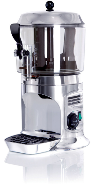
SCIROCCO SS 5 LTR - UGOLINI