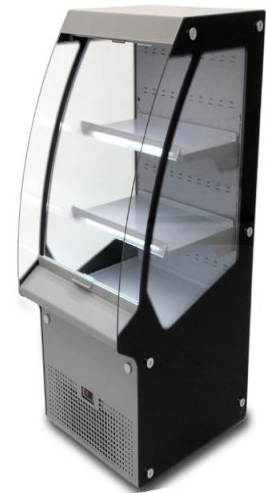
AVO HARMONY 135- 60 - ASTE

AVO product family consists of impulse coolers that can be placed on shelf, table or floor. They give you an easy solution for different locations to be used together or separately. The exterior of AVO products can be customized to your brand to give it the possible presentation.