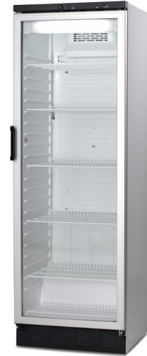
FKG 371 - VESTFROST

Ambient Rating : 32° Power Supply : 10 amp