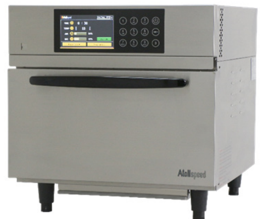
400H - ATOLLSPEED