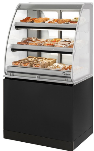
MC 75 AMBIENT SS CURVE

Inline display cabinet, full-serve or self-serve. Can be combined with hot and cold counters. Power Supply 10 amp. Available in 1000 and 750 mm width.