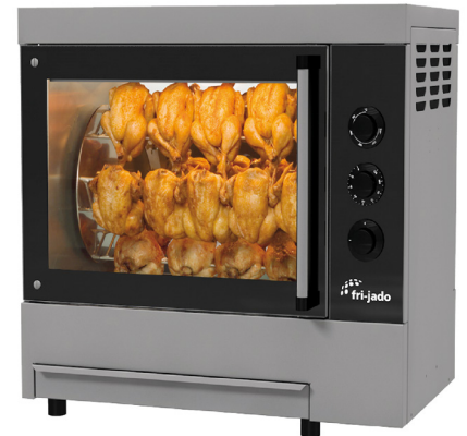
TGR 4 MANUAL - FRIJADO

Controls with manual settings, Set time, temperature and start of the rotisserie, Efficient heat transfer reduces energy consumption.