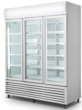
AQ ME T16A - AVEM QUIRKS

The largest and most popular cooler in the AQ ME series. This unit is a functional unit ideal for showcasing your products in front of house or reclaiming floor space as a storage outback. They use innovative cooling technology which makes maintenance of the cooler easier and faster, keeping products at an optimum temperature and providing market leading energy savings along with new features to deliver optimal performance, efficiency and reliability.