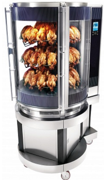
DELI MULTISSERIE - FRIJADO

Supplied on stand, Impulse generator, show cooking with 270-degree view, Fully automatic cleaning system with detergent and rinse aid dispenser, Cook Correction Technology to control food safety .