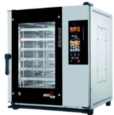
BISTROT STAR 665 - BOA