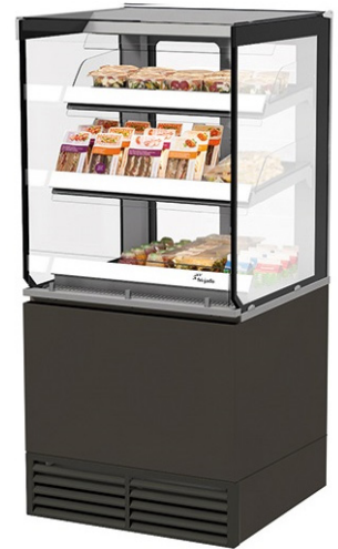
MC 100 AMBIENT SS SQUARE

Self serve unit that maintains product temperature between 2-5°C, guaranteeing long holding times. Multiple features such as reflector-enhanced TL lighting for attractive promotion, thermopane glass and interchangeable shelving. Can be combined with hot and ambient counters. A well-lit, clean and inviting hot, cold and ambient food system to cover all fresh food categories. An ergonomic design providing easy access. Unobstructed visibility for the customer. Easy to adapt to any format within new stores or retrofits. Providing the opportunity for increased basket sales through meal deals.