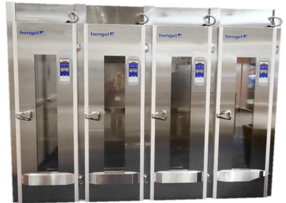
HGW58 SSG - HENGEL

Premium controlled retarder prover single rack chambers guarantee a perfectly even dough roll temperature. Suitable for any type of bread-making. Chambers are modular and can be added on when needed, making this proofing system unique and versatile.