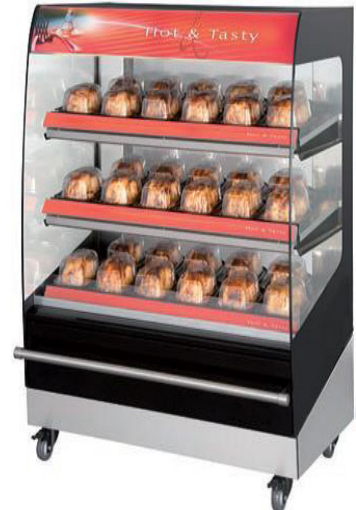
MD 3 LVL 120 - FRIJADO

Self Serve heated merchandisers, ideal near checkouts. Innovative airflow technology: no hot or cold spots. Boost Impulse sales, Upright design save space. Cross merchandising capabilities, Power Supply 10 amp.