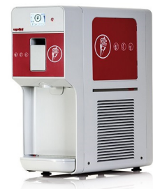
QUICK GEL - UGOLINI

Powerful variable speed brushless motor for any product and preparation, Product delivery by gravity through air regulation valve. Easily replaceable graphics on all sides for possible personalization. Removable panel for condenser cleaning Upper lid with anti-vibration gasket and optional locking. One piece mixer for dry, compact and consistent ice cream, Quick and easy dispensing.