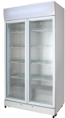
HUS C800 - AHT

A glass two-door cooler that includes a no frost cooling system, self-closing double-glazed doors, full length LED lights and a self-evaporating drip tray.