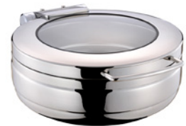
Round Chafing Dish 4 L Glass lid