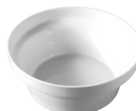
ROUND DEEP BUFFET BOWL 29cm / 4 Ltr AG 88303