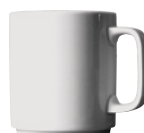
COFFEE MUG 0.25 Ltr AG 89301 0.30 Ltr AG 89302