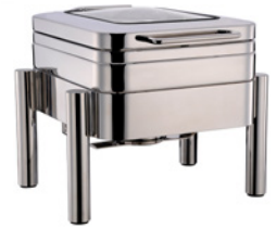
1/2 Chafing Dish Glass lid, on stand