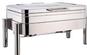
1/1 Chafing Dish Glass lid, on stand