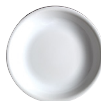
ROUND DEEP COUPE PLATE 16cm AG 89016 18cm AG 89018 21cm AG 89021 25.5cm AG 89025 30.5cm AG 89030 32cm AG 89032 35cm AG 89035 40.5cm AG 89040 46cm AG 89046