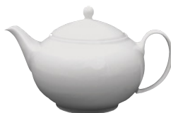
ROUND TEA POT - BASE 0.60 Ltr AG 85260 LID FOR ROUND TEA POT AG 85261