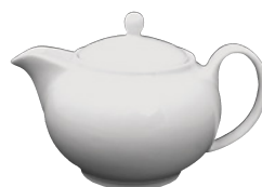
ROUND COFFEE POT - BASE 0.35 Ltr AG 85435 LID FOR ROUND COFFEE POT AG 85436