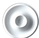
EGG CUP WITH SAUCER 13.5cm AG 85613