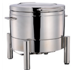
Buffet Soup Server Glass lid, on stand