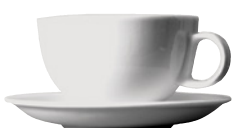
TEA / CAPPUCCINO CUP 0.27 Ltr AG 87704 SAUCER 15cm AG 89905