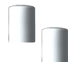
OVAL PEPPER SHAKER 6cm (h) x 5.5cm (d) AG 86020