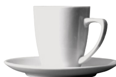
CAFFE CUP 0.25 Ltr AG 89906 SAUCER 15cm AG 89905