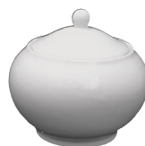
ROUND SUGAR BOWL - BASE 9cm AG 85709 LID FOR ROUND SUGAR BOWL AG 85710