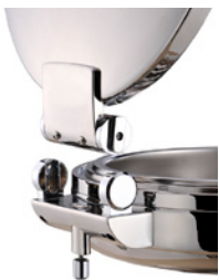
Removable Lid Easy cleaning and storage