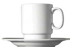
STACKING COFFEE MUG 0.22 Ltr AG 88809 0.25 Ltr AG 88805 0.30 Ltr AG 88808 SAUCER 16cm AG 88807