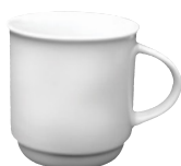
STACKING MUG 0.26 Ltr AG 88810