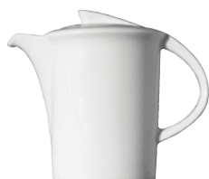
OVAL COFFEE POT - BASE 0.30 Ltr AG 84230 LID FOR OVAL COFFEE POT AG 84231