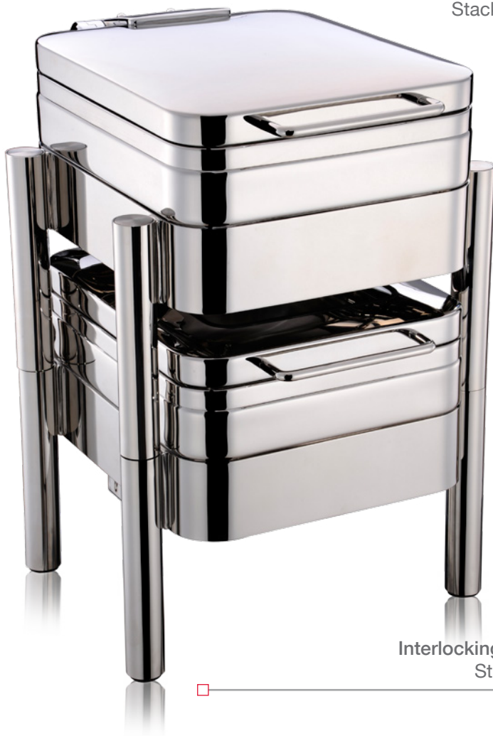
1/2 Chafing Dish Stacked for storage