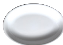
OVAL DEEP COUPE PLATTER 24cm x 16cm AG 83924 28cm x 18.5cm AG 83928 33cm x 23.5cm AG 83933 50cm x 35cm AG 83950 56cm x 42cm AG 83956