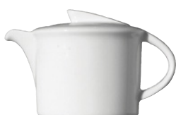
OVAL TEA POT - BASE 0.35 Ltr AG 84335 LID FOR OVAL TEA POT AG 84336