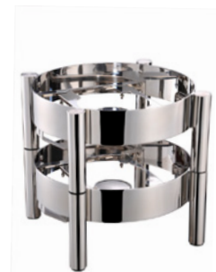
Stackable Stand Design