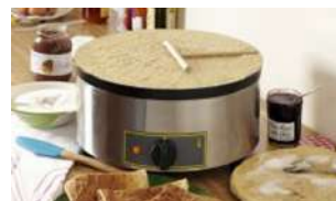
ROLLER GRILL Mobile Electric Crepe Machine with Enamelled Cast Iron Plate CFE400

High capacity crepe machines. High power output for outdoor use. Enamelled cast-iron plate 400 mm. Delivered with speler. spiral heating element integrated under the cast iron plate, thermostat 0 to 300°C, pilot light.