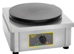
ROLLER GRILL Electric Crepe Machine with Enamelled Cast Iron Plate CSE400

Enamelled cast iron plate produces moist pancakes, buckwheat cakes and more. Also popular in Asian cuisine for preparing Peking duck skins. Drawer for keeping dishes or pre-cooked crepes warm. Spiral heating elements distribute heat evenly, essential when it comes to making the perfect pancake. Includes wooden crepe spreader.