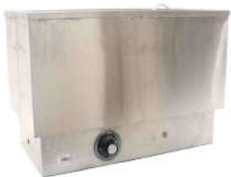
CCK Electric 3-Compartment Sauce Warmer / Bain Marie