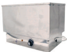
CCK Electric GN 1/1 Sauce Warmer / Bain Marie