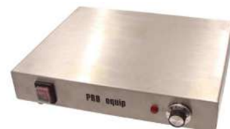
PRO EQUIP Stainless Steel Electric Warming Plate