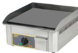
ROLLER GRILL Electric Griddle Plate

Specific steel griddle plate (10mm) to cook meat, bacon, fish, hamburgers, sausages, onions... and also for fried eggs and omelettes. Healthy and quick cooking with the mirror smooth plate for a direct temperature transfer. Built with a Incoloy heating element, for a homogenous temperature on the whole cooking surface. Removable drip tray.