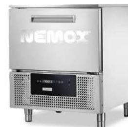
NEMOX Shock Freezer Freezy

Essential instruments to grant the best food preservation in the most natural way. SOFT and HARD blast-chilling cycles and shock-freezing cycle are regulated by temperature with the use of a core-probe or by time setting.