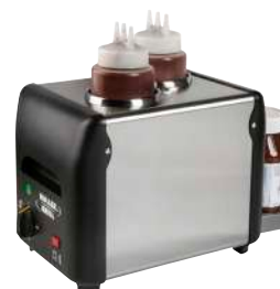
ROLLER GRILL Electric Double Free Standing Warm It Machine

The double electric warmer WI / 2 is a table-top warmer fitted with 2 black protective shells and a removable display for a pot of jam, honey or spread. This chocolate or sauce warmer can heat up 2 pressure bottles in the same time without bain-marie function.