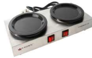
CROWN Stainless Steel Twin Coffee Warmer SW22

High efficiency and energy saving. Non-stick support plate. Safe & easy to maintain. Keep-warm function only.