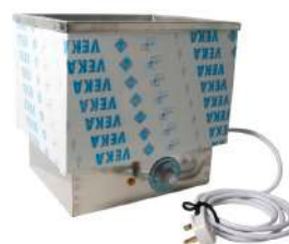
CCK Electric 2-Compartment Sauce Warmer / Bain Marie