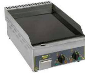
ROLLER GRILL Electric Steel Enamelled Griddle Plate

The PED700 is a high-performance dual zone electric griddle. Built around a 10mm thick steel cooking plate, it provides a solid cooking platform for your griddle menu; burgers, sausages, eggs etc. Unique 2 Zone heating.