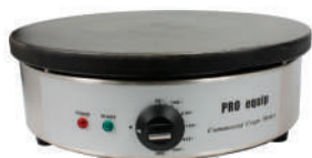
PRO EQUIP Mobile Single Crepe Machine