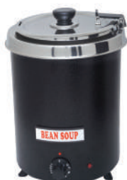
Electric Soup Warmer