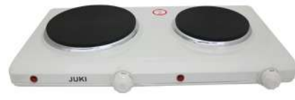
JUKI Double Hot Plate