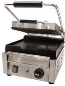
Panini Grill with Groove Top Only