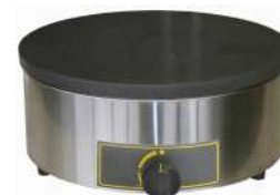
ROLLER GRILL Mobile Gas Single Crepe Machine with Enamelled Cast Iron Plate CFG400

The simple design of the 400CFG gives you greater mobility without sacrificing performance. Specially designed with 8 point star shaped burners to distribute heat evenly, essential when making the perfect crepe. The hard enamelled cast iron plates make delicious, moist, golden pancakes but also chapatti, blini etc.