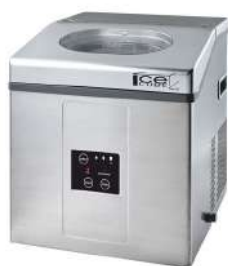
NEMOX Ice Cube Maker Ice Cube Tech

Produces Ice cubes. Makes 12 ice cubes (10-15g) in app. 6-10minutes. Daily output is about 15kg.