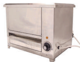
CCK Electric 4-Compartment Sauce Warmer / Bain Marie