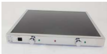
PRO EQUIP Glass Warmer with Stainless Frame for GN 2/1