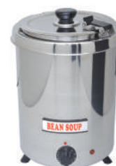
Stainless Steel Electric Soup Warmer