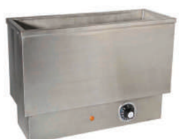
CCK Electric 3-Compartment Sauce Warmer / Bain Marie