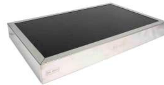
PRO EQUIP Glass Warmer with Stainless Frame for GN 1/1