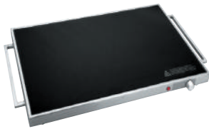
LACOR Stainless Steel GN 1/1 Warming Plate with Ceramic Top

It has a thermostat adjustable in temperature, thermo-insulating handles on the sides for a better safe movement and non-slip plugs.