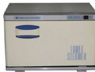
Hot & Cold Towel Warmer HC-70