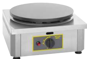
ROLLER GRILL Gas Crepe Machine with Enamelled Cast Iron Plate CSG400

The key to the great performance of the 400CSG is the specially designed 8 point star shaped burner positioned directly under the plate to distribute the heat evenly, essential when making the perfect crepe.