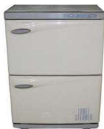
Two Door Hot & Cold Towel Warmer HC-140