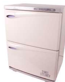
Two Door Towel Warmer CN-140