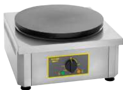
ROLLER GRILL Electric Crepe Machine with Enamelled Cast Iron Plate CSE350

Enamelled cast iron plate produces moist pancakes, buckwheat cakes and more. Also popular in Asian cuisine for preparing Peking duck skins. Drawer for keeping dishes or pre-cooked crepes warm. Spiral heating elements distribute heat evenly, essential when it comes to making the perfect pancake. Includes wooden crepe spreader.