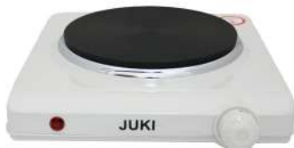
JUKI Single Hot Plate