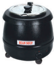
Stainless Steel Electric Soup Warmer