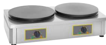
ROLLER GRILL Electric Double Crepe Machine Enamelled Plates

The sturdy clean design gives the perfect front of house platform for crepes, pancakes, chapatti, blini etc. but also for other menu items, griddled eggs for example. The hard enamelled cast iron plates give good heat retention and provide a smooth, hard wearing cooking surface requiring minimal oil and no pre-seasoning.