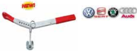
VAG 2.0 TDI Diesel Filter Wrench