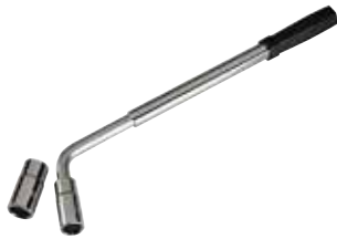
Telescopic Handle 17, 19, 21, 23mm Flip Sockets Cushioned Grip Handle