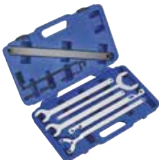
For Servicing Thermo-Viscous Water Pump Cooling Fans On Mercedes, BMW, Ford & Vauxhall/Opal vehicles Plus Other Applications. Long Slim Design Assists Removal of Bound Or Stubborn Threads. Presented In A Durable Blow Moulded Case