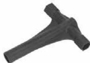
4 Way Tool For The Removal & Replacement Of The 11 & 12mm TPMS Sensor Nuts & Also Reseating The Bevelled & Non Bevelled Sensor Grommets.