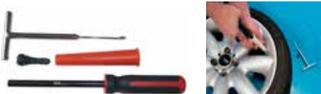
Allows The Removal Of Tyre Valves Without The Need To Remove The Tyre For Steel Wheels & Valves On Motorcycle & Agricultural Wheels. Not Suitable For High Pressure Valves