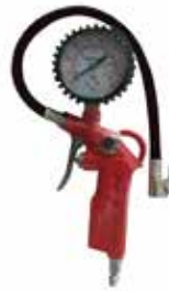
0-180 psi General Purpose Tyre Inflator, Alloy Body & Rubber Gauge