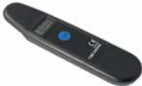
Easy To Read Digital Display Uses 1 CR 2032 battery (included) Range 0-100 PSI / 0-6.9 BAR Auto Power Off