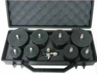
Pressure system to check turbo