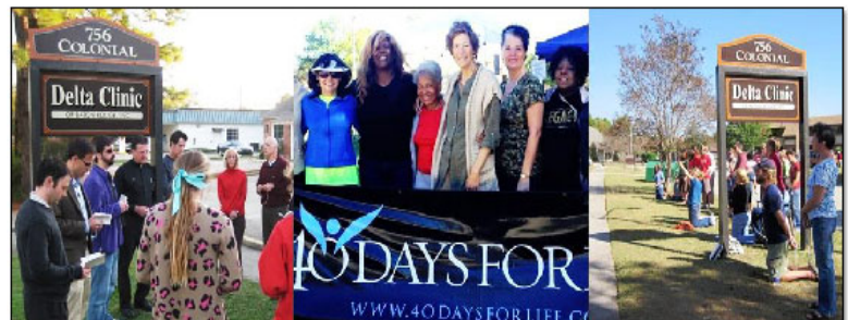
Participants from 40 Days for Life Baton Rouge last fall.

Sponsored by Baton Rouge Right to Life and the Office of Marriage and Family Life, Diocese of Baton Rouge