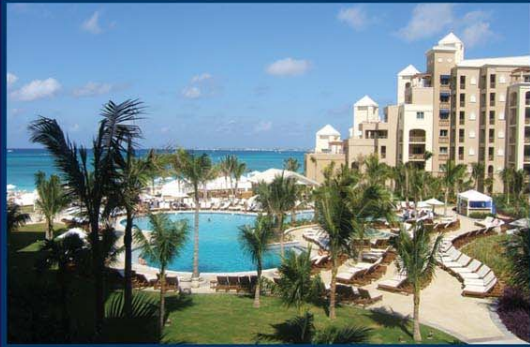
The Ritz Carlton Grand Cayman