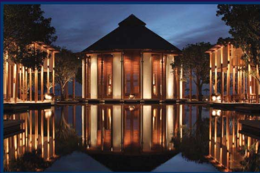
Amanyara Resort Turks and Caicos