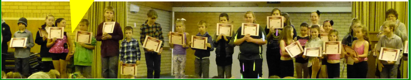
2016 Talent Quest Winners

Don't forget to come and see the talent of the CCS Primary Students. Friday 28th July, 2pm in the School Hall. Entry Fee of $1 goes towards Bear Cottage.