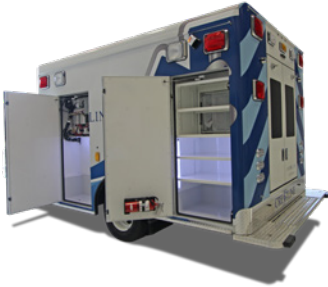
The CCL 150 offers 50.8 cu. ft. of exterior storage space.