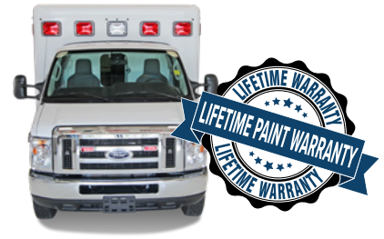
CrestCoat is a durable and cost effective corrosion prevention solution backed by a Lifetime Paint Warranty.

Worry-free maintenance with readily available parts.