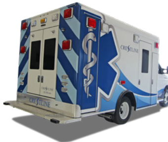
The all aluminum underbody bumper protects the module in low impact collisions.