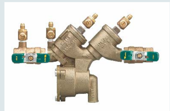
Reduced pressure zone backflow assembly device (RPZ) | www.watts.com

RPZ (Reduced pressure zone backflow assembly device). These are the most complex and sophisticated backflow devices for high-hazard and backpressure applications. RPZs have always been required to be tested.