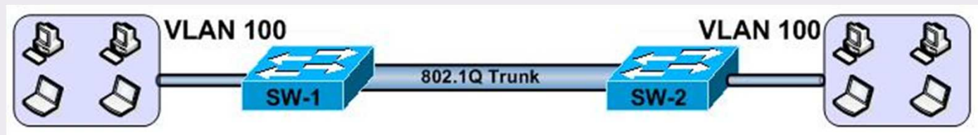
DIAGRAM # 1