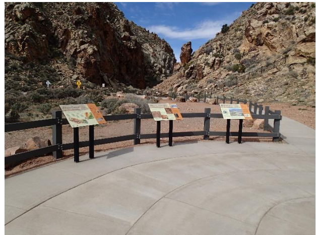
Parowan Gap Petroglyphs Visitor Site