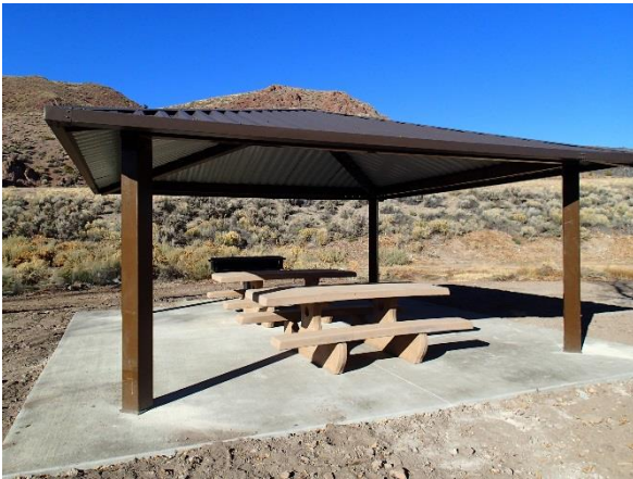
Large Pavilion-Hanging Rock Recreation Site