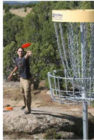
Three Peaks Disc Golf Course