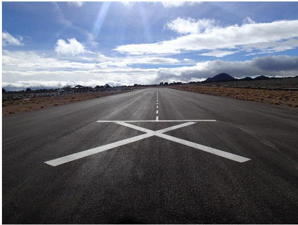
Three Peaks Model Port