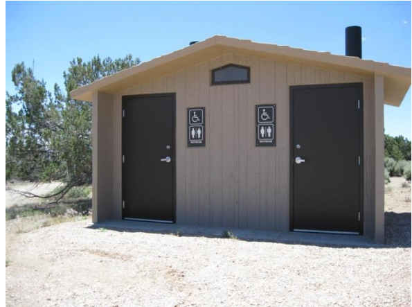
Double vault toilet at Rocky Peak Campground