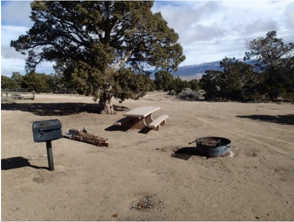
Individual Campsite at Rocky Peak Campground