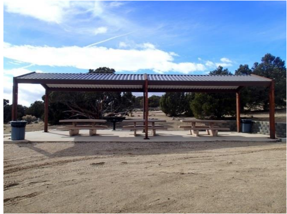
Large pavilion at Rocky Peak Campground