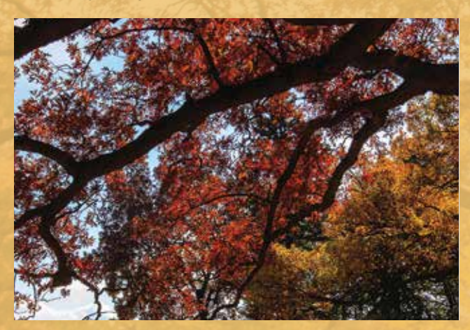
Fall oaks at Herrick Lake