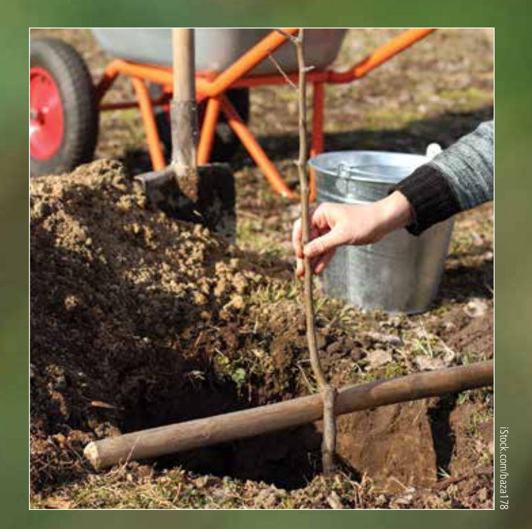
Whether your oak is from a nursery or is one you raised from an acorn, the best time to plant it is spring or fall, when it's coming out of or going into winter dormancy. You can plant in summer but will have to spend more time watering.