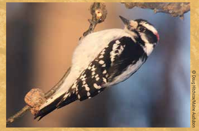
Downy woodpecker eating from an oak gall