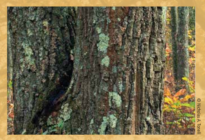
Lichen growing on a red oak