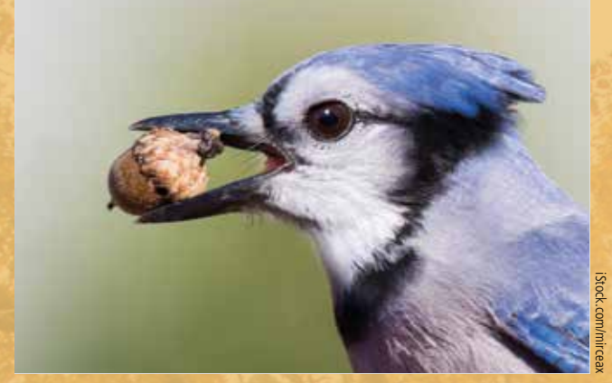
Blue jay with an acorn

And thanks to your readers for caring about oaks! •