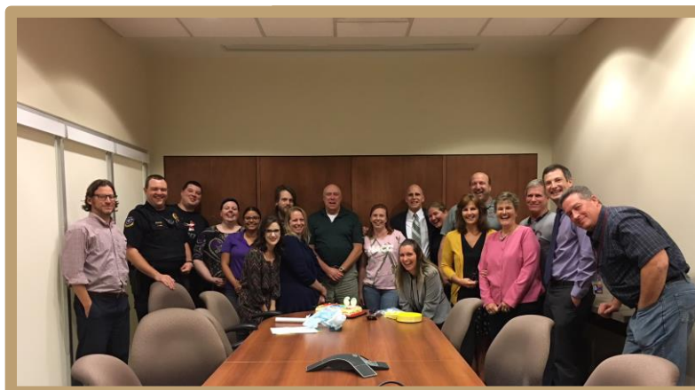
Celebrating Lebanon Campus employees recently.