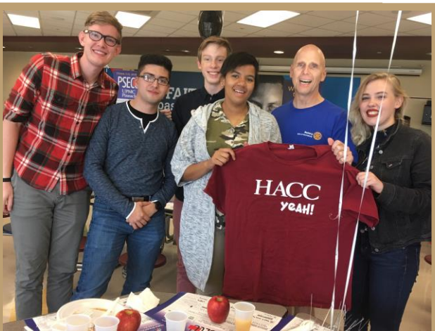
Student Government Association leaders from the Harrisburg Campus joined me at a Rotary breakfast held at Harrisburg High School.

Temperature set points are established for every building on each campus. During winter, the temperature is set to 70 degrees. There is a plus or minus two (2) degree variance that is acceptable as monitored by the Facilities Maintenance Department (FMD). The College considers this an adequate comfort level. However, the Heating, Ventilation and Air Conditioning (HVAC) system works by area zones throughout each building and within a given zone, there may be some variance in temperature.