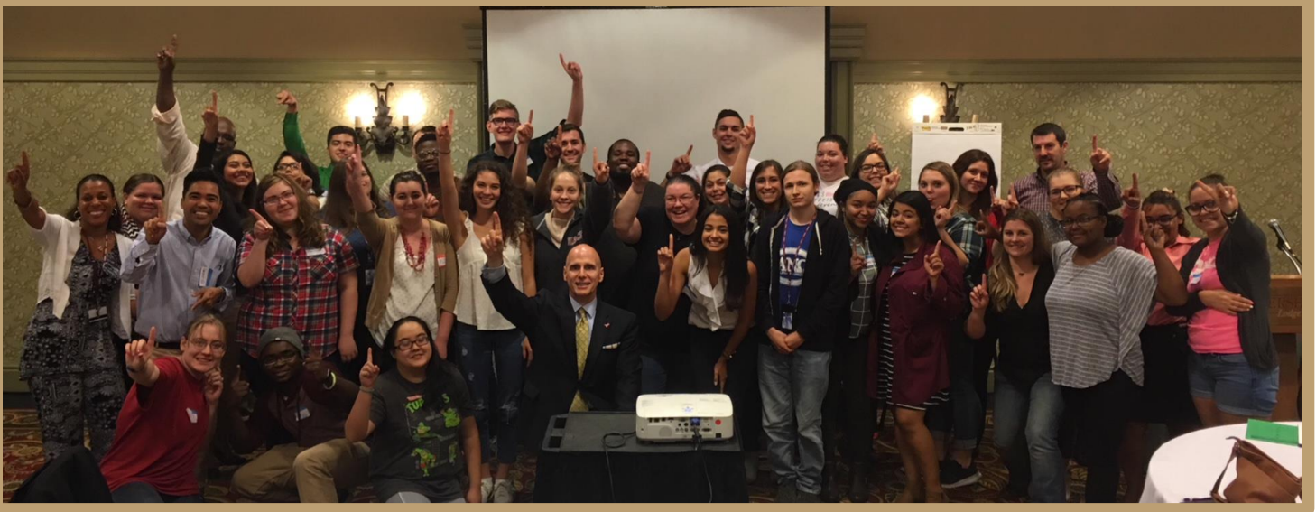
I visited with HACC's student leaders when they gathered in Hershey for a retreat.

If you have any questions, please email oca@hacc.edu .