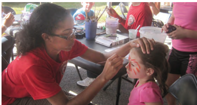
Face printing at our two annual Family Days is always a popular activity for children of all ages.