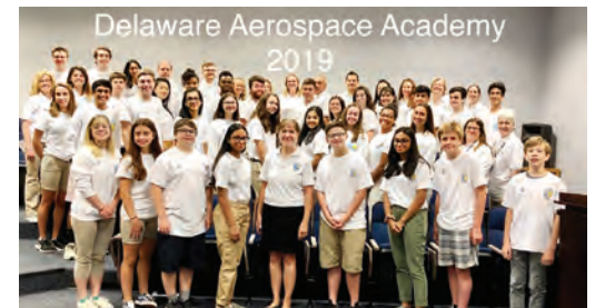
DASEF's 2019 Academy Staff!