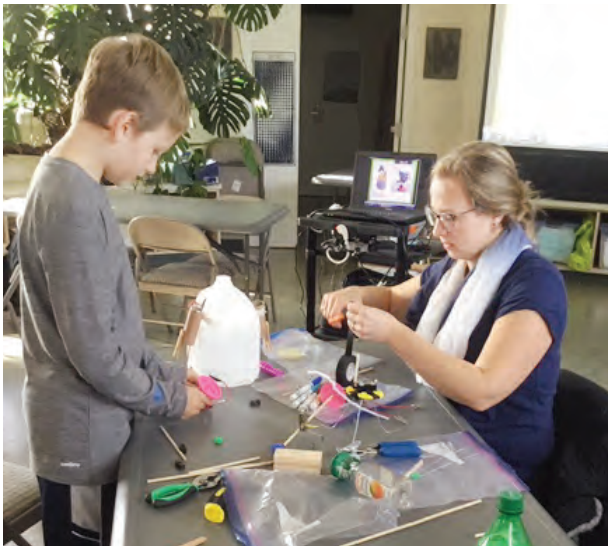
Mother and son busy constructing during one of DASEF's Build a Bot Explorations.