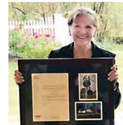
During the Pandemic, DASEF was recognized as one of three Outstanding Small Businesses through the Central Delaware Chamber of Commerce in Kent County, Delaware.