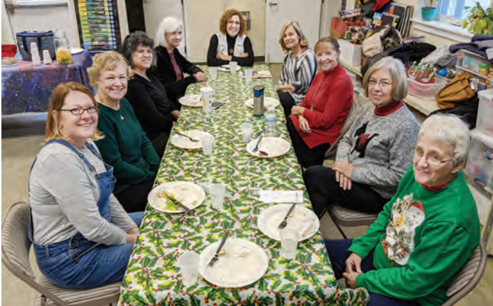
DASEF's Staff members gather for our 2019 Christmas luncheon.