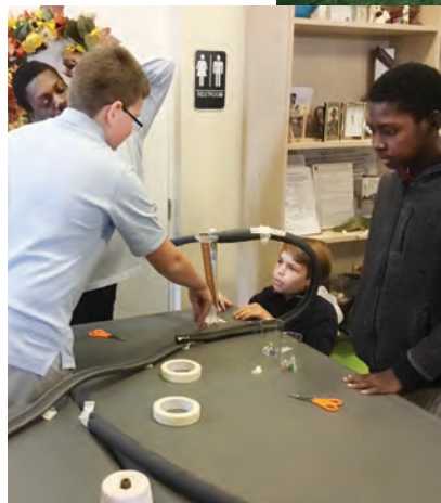
Smyrna Christian School students investigate the Forces of Nature.