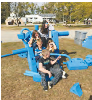
Children design and build a Lunar Rover with DASEF's Imagination Playground.