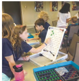
Using unique Turing Tumble kits, children learn the principles of computer coding.