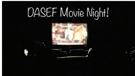
In an effort to connect with the community, the Delaware Electric Cooperative sponsored DASEF's first Drive in Movie on October 17, 2020. NASA bags with SPOOKY lessons and NASA handouts from Delaware Space Grant were distributed to 55 cars in attendance.