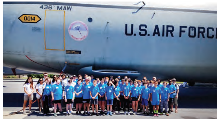
Destination Orbit cadets get briefings and a tour at the Dover Air Force Base.