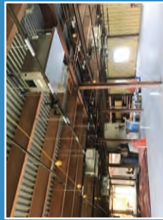
ITEC Education Building progress photos showing the completed fire protection and heat pump installations on all 3 floors.

DASEF strives to improve the quality of life through its advocacy of education, the environment, and strengthening the workforce.