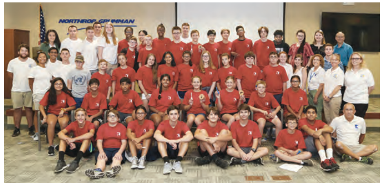
Staff and cadets from Destination Mars get a briefing and tour at Northrup Grumman.