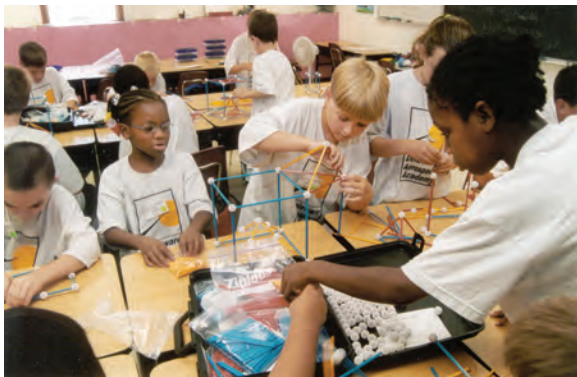
Cadets design mathematical structures in Destination Sky and Beyond.