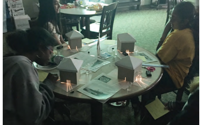
During a Girl's After School Program sponsored by Painted Stave, young women use Agilent kits, to explore lighthouses and light refraction.