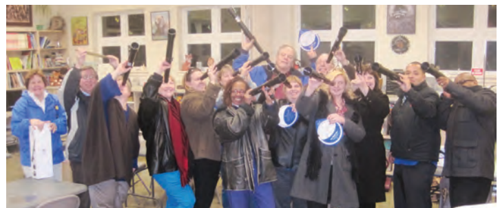
During an Educator Eyes on the Skies workshop, teachers construct and learn to use a Galileoscope compliments of NASA Space Grant.