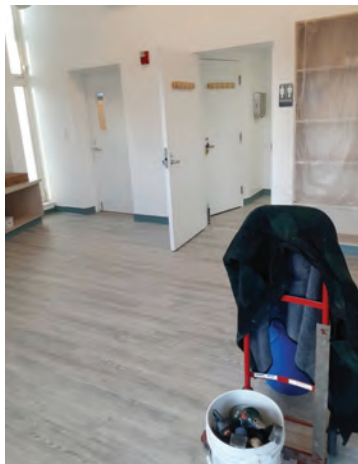
During the hiatus, DASEF had some needed renovations done at the Outpost.