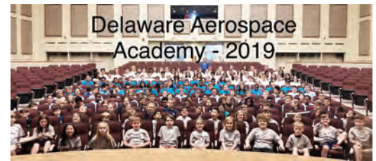
DASEF celebrates 30 consecutive years of hosting the Delaware Aerospace Academy!!