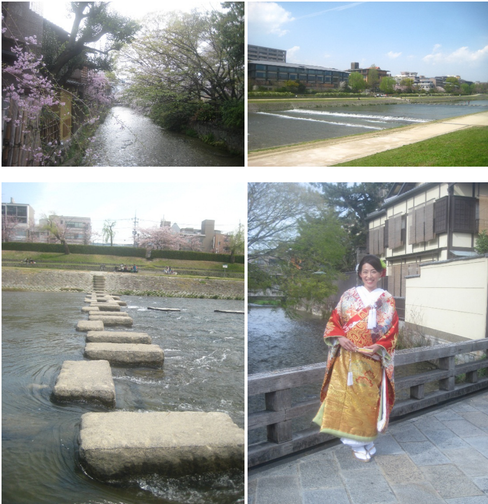
Figure 3: Lives around water in Kyoto.

Japan adopted municipality system for Kyoto led by national government in 1889 and in 1898 autonomous city government was established and started with the concept of preservation of the scenic beauty and noteworthy sights and historical scenery without compromise. The City Planning Act and the Urban Building Law were enacted in 1919 which enforced regulations concerning zones and districts, building height and structure. The Scenic Landscape District designation of 1930 covered area-level preservation of Historic, Scenic and Natural Monuments and neighborhoods.