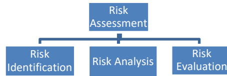
Figure 2: Risk assessment.