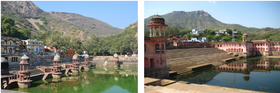
(c) Rain water-fed Urban Lake in Alwar