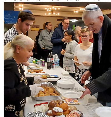
Latkes & Soufganiot for All!