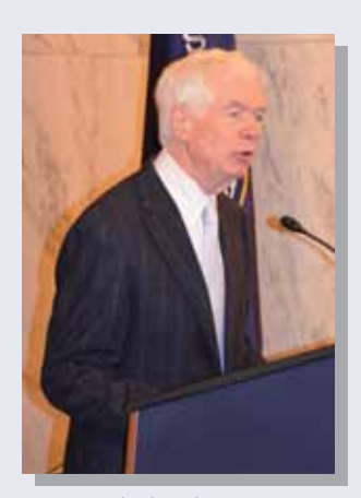
Senator Thad Cochran (MS)