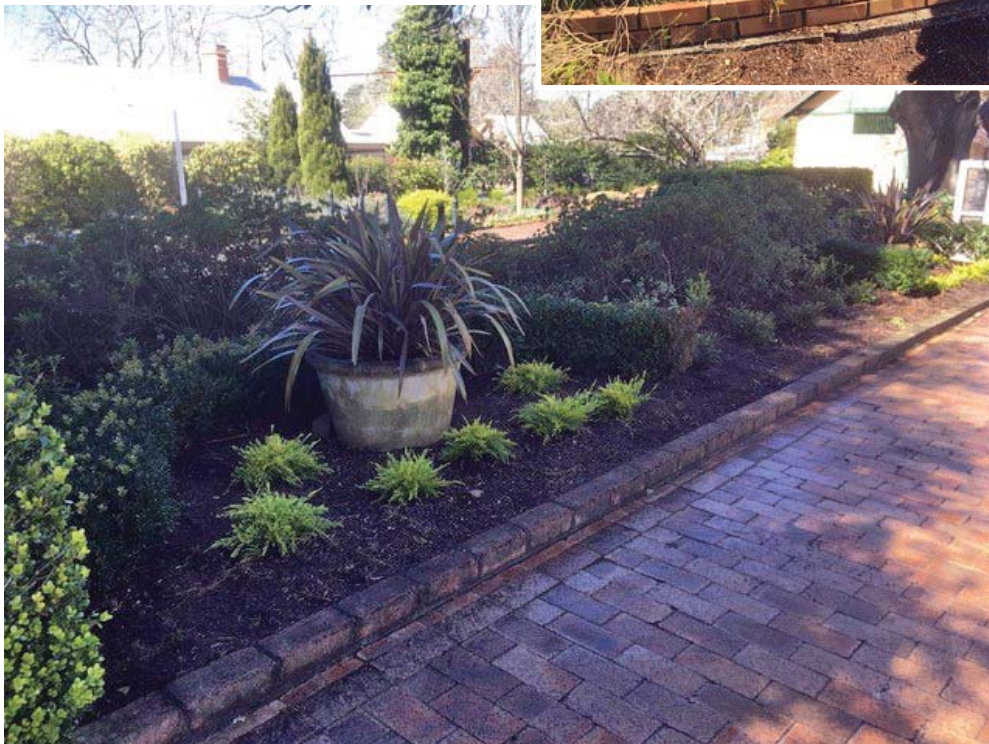
The new front garden at Coronation Park, Wentworth Falls - old Hebe and Diosma removed and replaced with same.

Older plants have been replaced with new plants of the same variety and will be full and lush in no time.