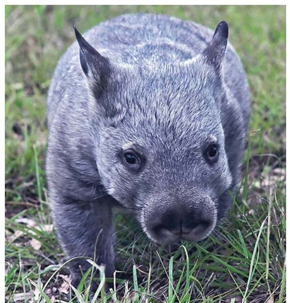
Northern Hairy-Nosed Wombat