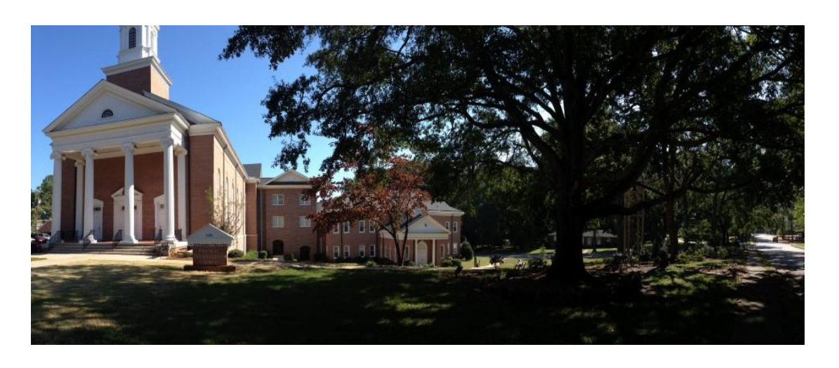
Central Presbyterian Church 1404 North Boulevard