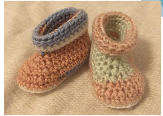
Booties crocheted by Julia for a soon to arrive niece or nephew

I like to read a lot and taught myself how to crochet through YouTube videos. I have been crocheting a lot in lockdown – I finally finished a project I have been working on for a long time. At this stage I have only completed blankets, but I have just purchased a pattern to make a jumper for my next project. I hope learning new things keeps my brain active.