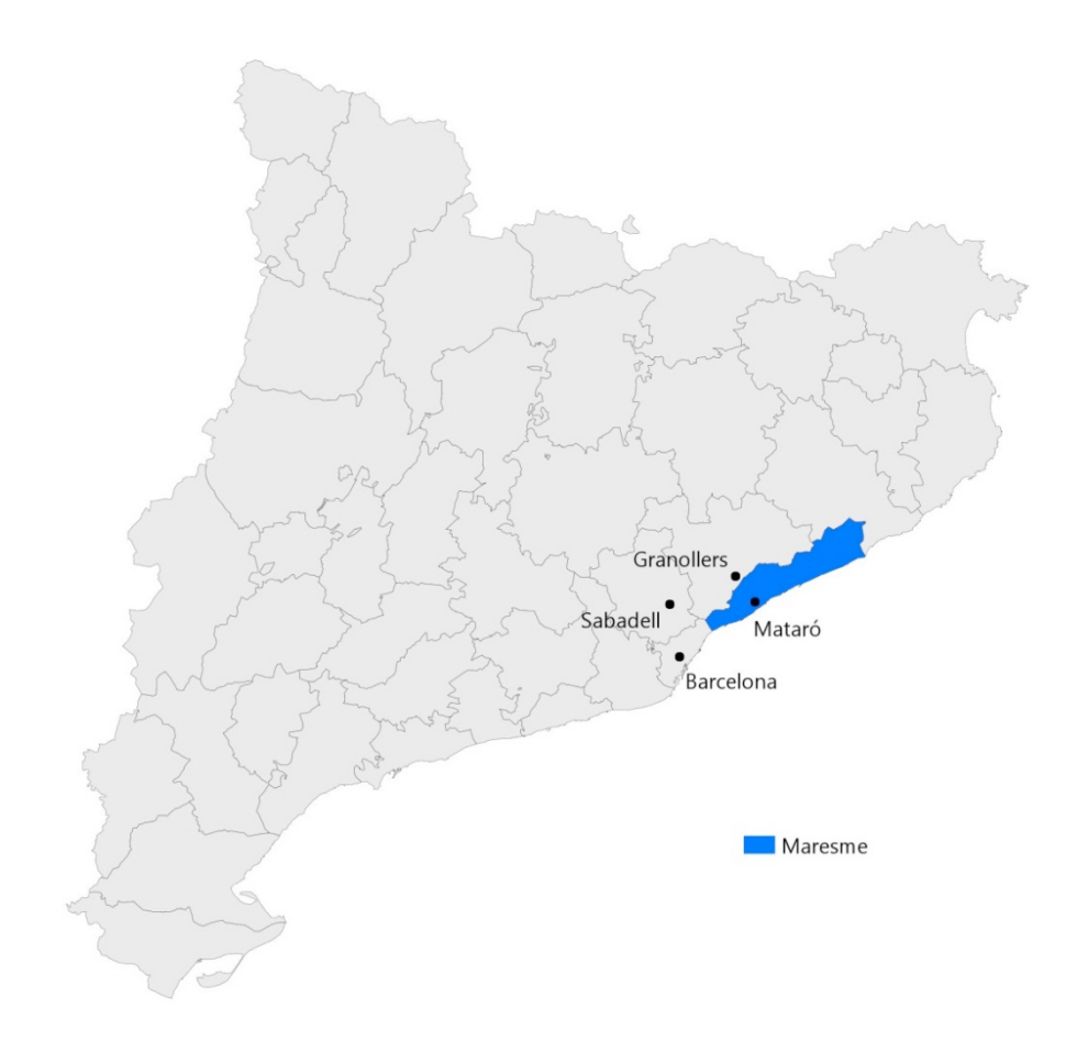
Map I Fieldsites in Catalonia

West African migration is not a recent phenomenon. Taking the Casamance region as an example, migration is at the heart of a variety of different forms of diversities: ethnic, linguistic, religious, and national. Accounts go back to the 13th century when immigrants from the Mali Empire settled in the lands of Casamance River, which had previously been mainly inhabited by the Bainunk ethnic group (Roche 1985: 53-6; Quinn 1972: 482). Equally, the Jola of the lower Casamance were immigrants as well as the Fula of the upper Casamance<sup>5</sup> (Roche 1985: 28-32; Linares 1992: 84-90; Quinn 1971; Bâ 1986: 60-5). Later, Muslim marabouts came to the area with their followers to convert people to Islam (Leary 1971, 1970). The independence movement of the Fula, previously under Mandinka domination, also sparked a lot of movement (Bâ 1986; N'gaide 1999; Quinn 1971). This spatial mobility never really stopped. Traders always circulated, slaves were sold and shipped, migrant labour went to harvest rubber and palm oil and to cultivate the groundnut fields in both Senegal and Gambia to earn their living (Foucher 2002: 64; Mark 1977, 1976; David 1980). Soon, internal migration to the urban centres of Bathurst (today's Banjul) and Dakar started (Hamer 1981;