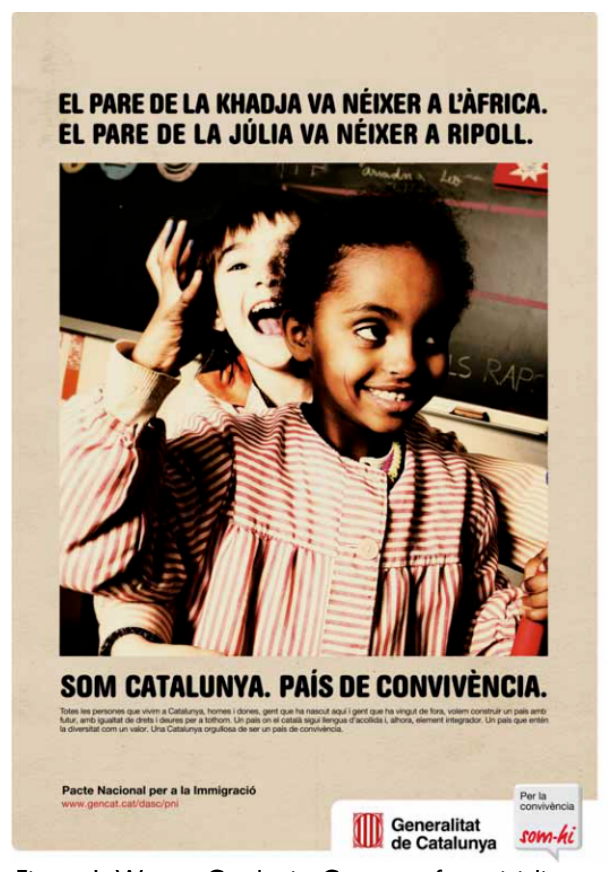
Figure I: We are Catalonia. Country of conviviality.

'Som Catalunya. País de convivência' - in 2009, I was welcomed back to my field site by three posters portraying two people each, of different ages and different ethnic backgrounds. The headlines stated the different countries of birth of either the parents or grandparents of the individuals depicted. Under the main slogan 'We are Catalonia. Country of convivencia, it said that natives and people who had moved there aimed to construct together a country with a common future, and with equality of rights and duties for all. Catalan was meant to be an integrative element as the language of reception. And finally, the poster stated that in Catalonia diversity was an asset, and that Catalonia was proud to be a country of convivència.16 Despite the many alternative terminologies and more detailed goals of the