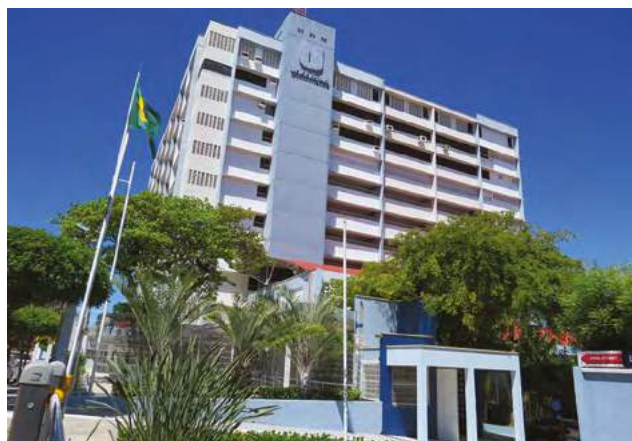
/ Dionísio Torres /

Located in the heart of the commercial and financial center of Fortaleza, this Campus brings together undergraduate courses in Business Administration, Architecture, Law, Civil Engineering and Industrial Engineering.