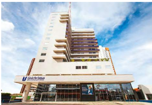
/ Dom Luís /

Located in the heart of the commercial and financial center of Fortaleza, this Campus brings together undergraduate courses in Business Administration, Architecture, Law, Civil Engineering and Industrial Engineering.