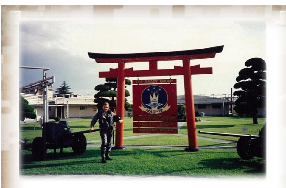
Farewell and following seas to a warrior, scholar, and true patriot