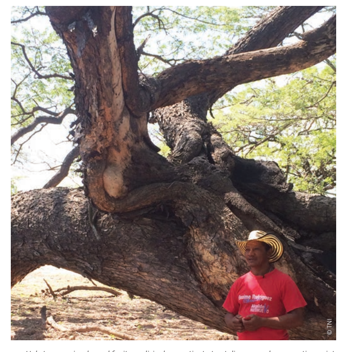
Holy tree, previously used for its medicinal properties to treat diseases and as a meeting point for the community, its big shade used to protect a lake.

Despite the harsh conditions, the diverse local populations of La Guajira are working together to expose the truth about mining in Colombia. Popular environmental education programmes build locally held knowledge that can counter the years of government and corporate misinformation. Days of action have also brought together numerous organisations and communities from La Guajira, the rest of Colombia and also internationally. Actions include holding popular tribunals against mining, visits to sacred sites, and autonomous public hearings held to define the future of the territory.<sup>21</sup> Today, they also work to denounce and to give greater visibility to the situation through the La Guajira le habla al país website www.extractivismoencolombia.org.<sup>22</sup>