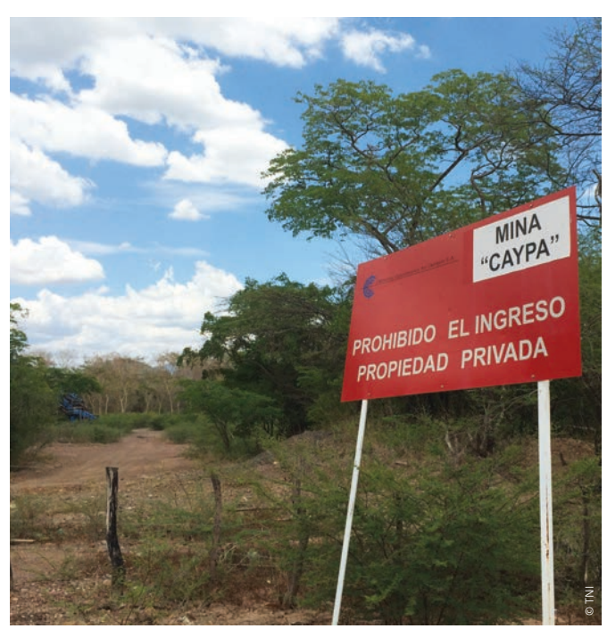
A sign blocking the entrance to part of the mine.

The financialisaton of nature means common resources are transferred into the hands of corporations and the financial system, concentrating power over them further, while communities lose sovereignty and their rights to use and live in their own territories.<sup>6</sup>