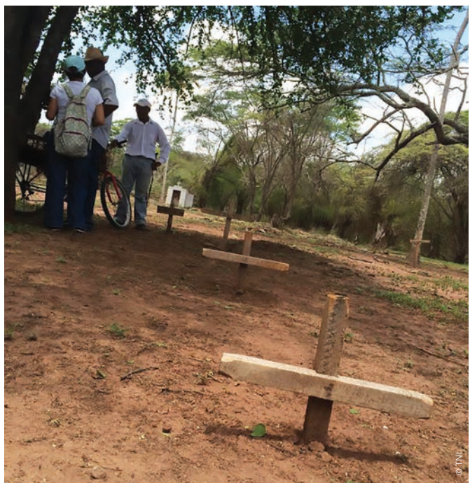
A cemetery in the Roche Community territory.