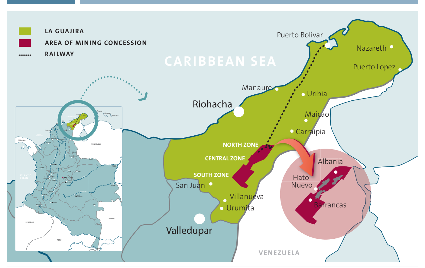
The mining complex extends over 69,000 hectares, of which approximately 4,000 are currently active. Over 30 years of open-pit coal mining have profoundly affected, directly and indirectly, the peoples of La Guajira, home to one fifth of Colombia's indigenous people.