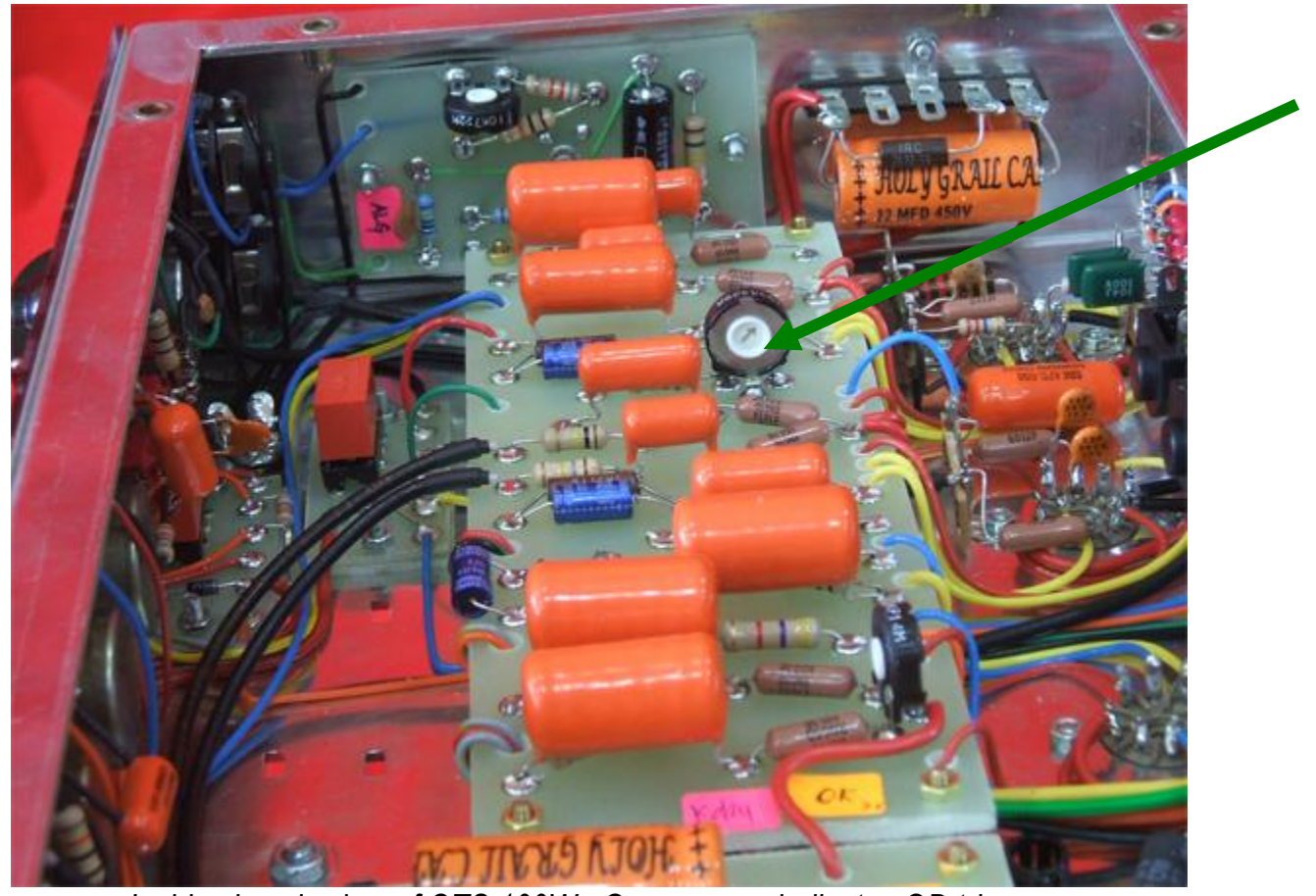
Inside chassis view of OTS 100W. Green arrow indicates OD trimmer.

I've read about something called a PI trimmer inside of the amp. Does the OTS have it, and what does it do?