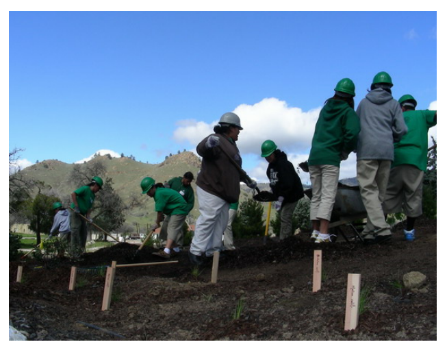
Cesar Chavez Day of Service