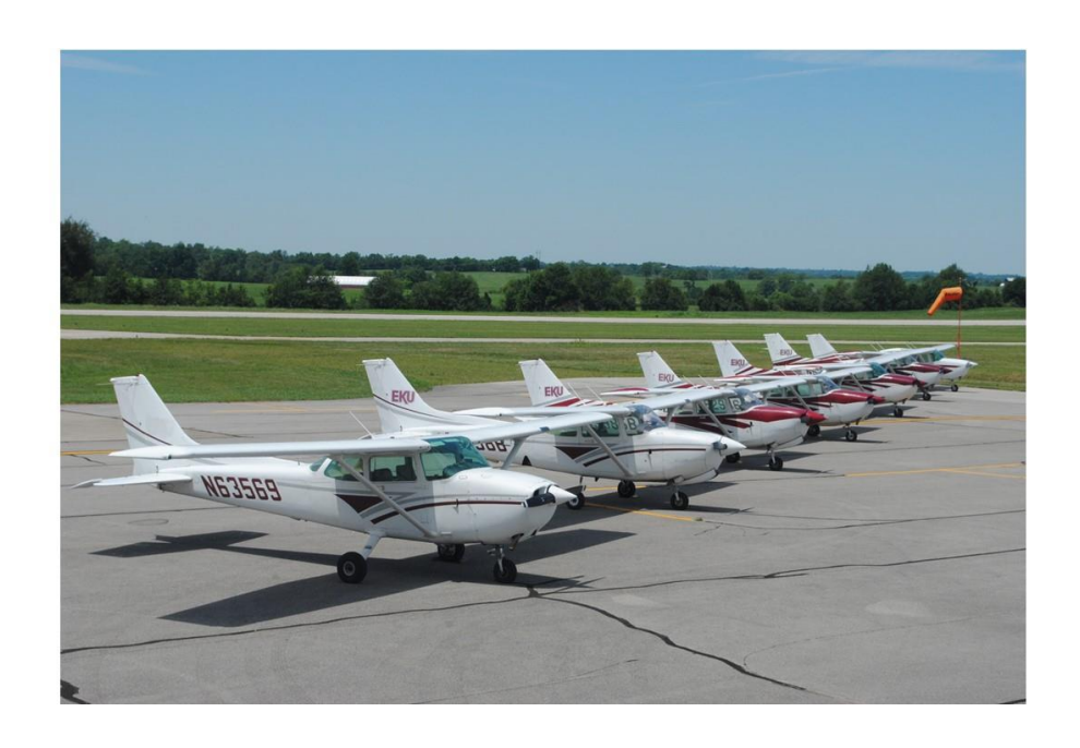
Cessna 172 Maneuver Description Guide Private Pilot & Commercial Pilot 2020