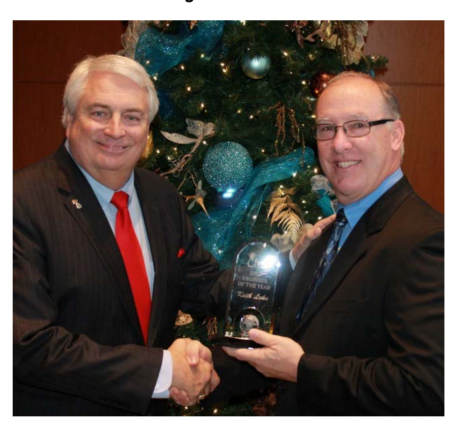
Keith Luka Holiday Inn Resort Orlando Suites - Waterpark