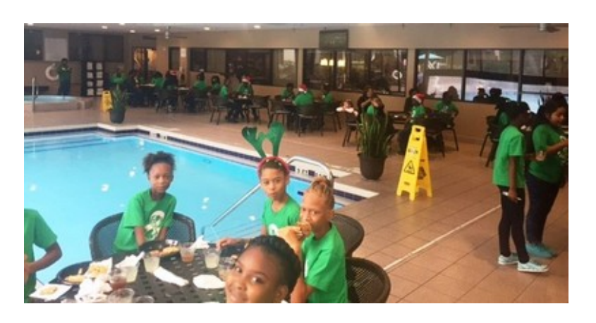
Thank You Sheraton Suites Orlando Airport for your support of education in Central Florida!