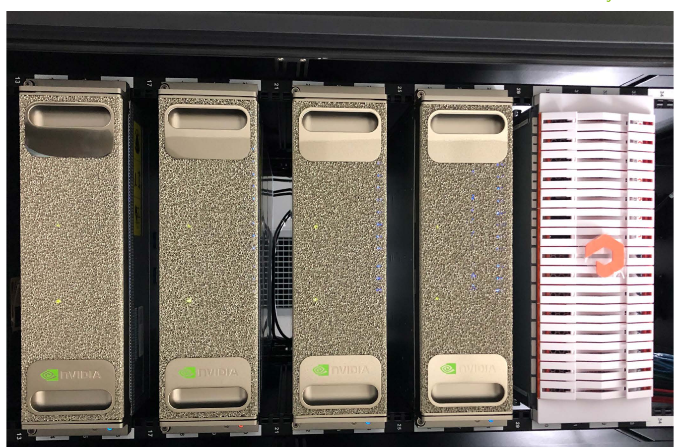
AIRI Solution with 4 NVIDIA DGX-1 and Pure Storage FlashBlade

The AIRI solution has already started to improve clinical processes and increase the productivity of CGMH doctors. For example, CAIM developed an AI tool to analyze antinuclear antibody immunofluorescence patterns, which is an essential medical tests to diagnose complex diseases such as lupus and Sjögren syndrome, and takes seconds to provide accurate answers (>99% accuracy) for clinicians to assist reporting.