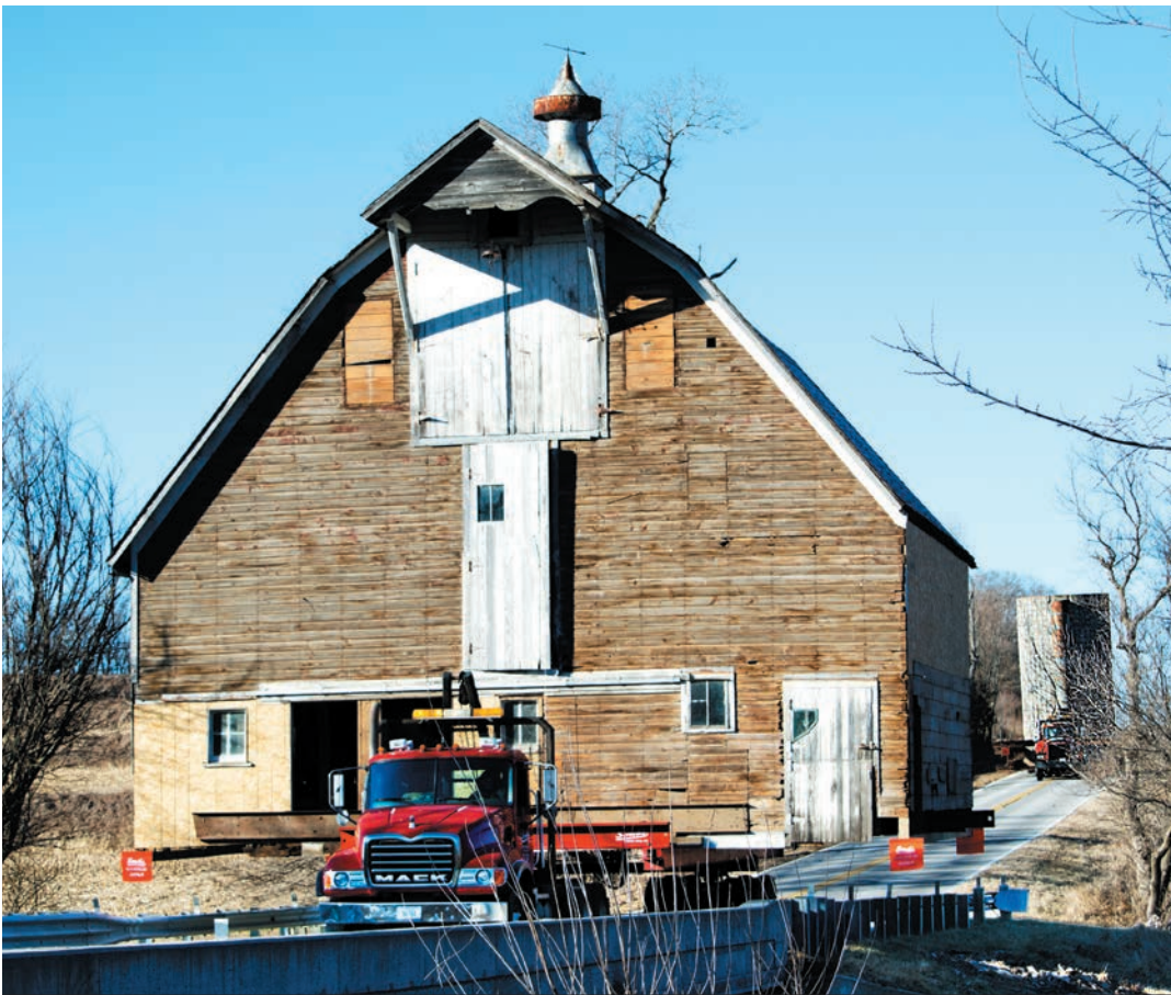
Early on a crisp morning in January, the old barn and silo floated slowly toward Allwine Prairie on specially designed trailers pulled by 300-horsepower trucks. When darkness fell, the time travelers had nearly completed the four-mile journey.

For contact information as well as progress reports, please visit http://www.unomaha.edu/prairie/