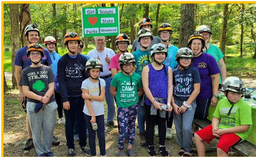
Carter Caves State Resort Park