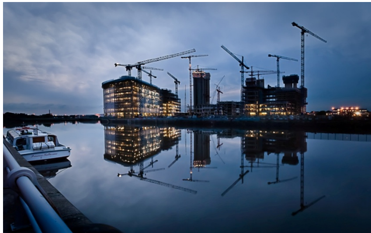
Figure 1: MediaCity UK

MediaCity University of Salford (UoS) provides the live case- study for the proposed research. Occupied in September 2011, it provides 9,600m 2 of integrated space comprising 2,800 m 2 of open public access spaces including 'living laboratories' and large public performance spaces. This is juxtaposed with high-end teaching and research facilities developed and designed as a flexible drop-in facility. The space is designed to facilitate an incubation culture where cross fertilization of education and learning can grow in a natural organic way, with the intention of creating complex outcomes.