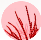
Red algae stem cells: protects and reduces the sebum production