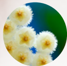
Porcelain flower: enlightens the skin