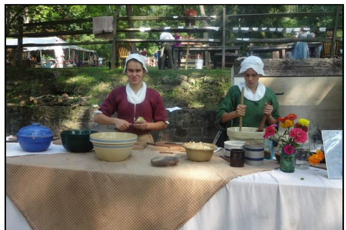
Open fire and hearth cooking was one of the original Hay Creek Festival demonstrations. Look for our young team to cook up old time festival favorites like "chomp" and other items which include stews, pies, and apple fritters.