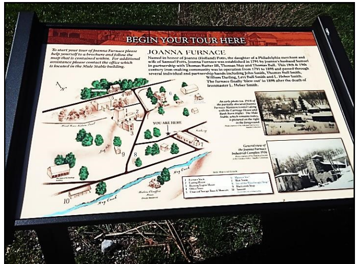
One of the new informational and interpretative signs which are installed at the Joanna Furnace complex to assist visitors in understanding the historic significance of the site. Additional signage will be added in 2016.

The festival committee is working on adding evening entertain-