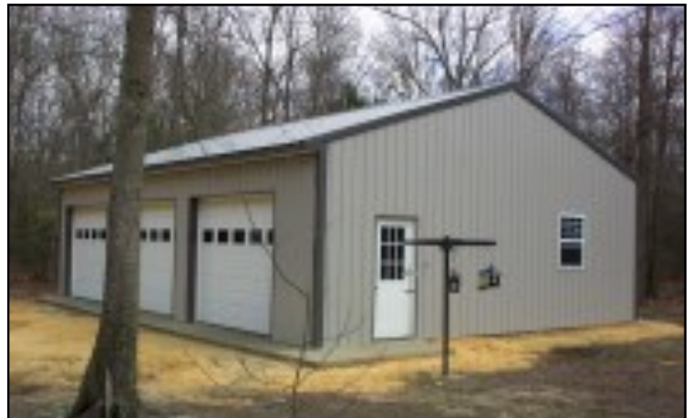
A storage building similar to this but with four bays will be constructed at the far end of the Mechanical Technology area. The purpose of this building is to store gas powered maintenance equipment, trailers, wagons, etc. so the organization has additional space in historic buildings for exhibits and interpretation during educational programs.

At the March Hay Creek Valley Historical Association board meeting the officers and directors voted unanimously to approve the 2016 Capital Budget. This budget included the construction of the 40'x 60' storage building in the Engine Area, purchase of the Generac 48 KW generator, and the Bank Barn stone wall restoration project in the Mansion area. In total these projects will cost $115,000 and be financed through several funding sources including utilizing approximately 20% of the cost from the organization's investment accounts and the remaining portion to be funded by our local financial institution with a three-year loan. Moreover, the organization will incorporate these projects to gain additional support from our annual campaign letter with our Hay Creek friends and membership. We thank you in advance for your support!