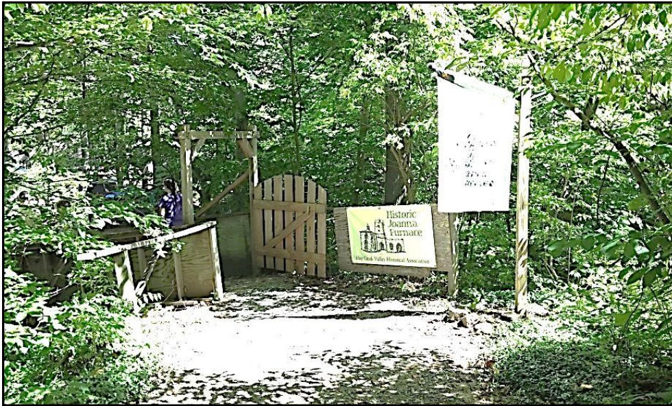
The Route 10 entrance to the Joanna Furnace site showing how visitors to the Hay Creek Festival leave the present and enter the 19th century at Joanna Furnace.

The year 2016 is shaping up to be a significant year for Hay Creek and Joanna Furnace. Along with many of the site improvements, one of the changes with the most impact will be the newly re-imagined 40 th edition of the Hay Creek Festival. This year's event will take place September 9th–11th.