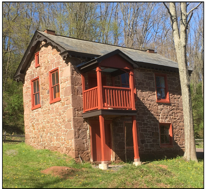
The Joanna Furnace Office/Store Building with the recently completed porch. Restoration volunteers are now working to restore the basement area and create displays in this level.

While we are unable to pour molten iron as was done for over 100 years, we do pour molten aluminum in sand molds to demonstrate the process. Watch our casting crew ram up sand molds using time-honored methods, with patterns – some are new this year – and see the molten metal hand poured from a ladle into the completed molds. After cooling, watch the molds broken open, and the casting removed. Once cool, the casting is finished and presented for sale as a souvenir.