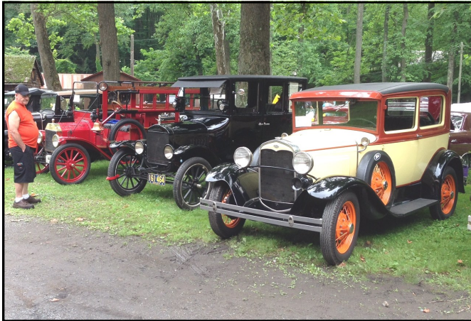
Vehicles of all types including antique cars will be a part of the 2016 Hay Creek Classic Car & Motorcycle Show.

We are honored to announce our Hay Creek Classic Car & Motorcycle event will take place on June 18 th 2016. Once again the event will honor all Veterans from past American wars. The event will run from 7 am to 2 pm.