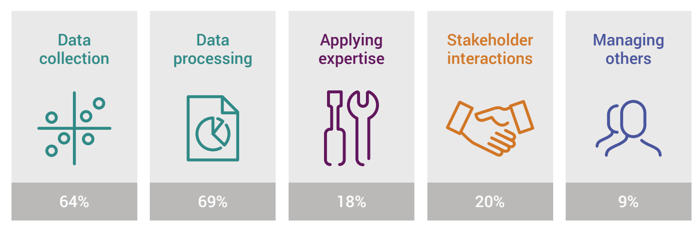
Figure 3: McKinsey's report into the technical potential for automation in the US