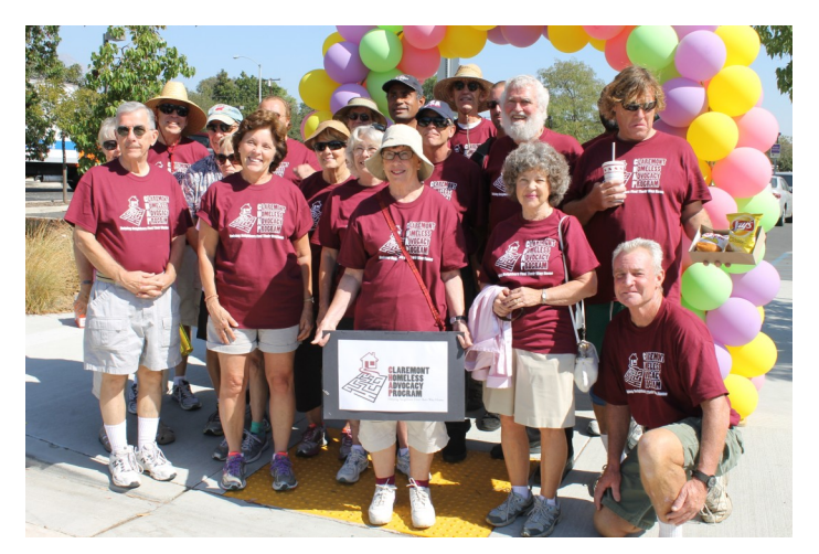
The group from CHAP came out in support of our efforts at last year's Walk for the Hungry. We are excited by the opportunity to further collaborate with them to serve the homeless in Claremont and beyond.

CHAP is a grassroots, all-volunteer group that seeks to end homelessness in Claremont by advocating for and supporting homeless adult individuals, primarily men, within the community. The group was born out of the Occupy Claremont movement in which homeless individuals slept on city hall property in fall 2012. Following this movement, Tri-City Mental Health funded an exploratory program to evaluate the homelessness situation in Claremont and found there to be 54 homeless single men and women in the city. Appalled by the situation and willing to help, the founding members of CHAP established the group in July 2013.