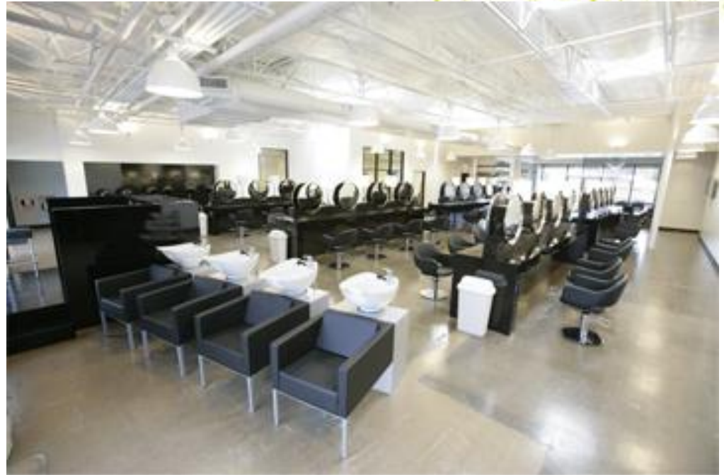
Early Twentieth Century

© 2012 Milady, a part of Cengage Learning