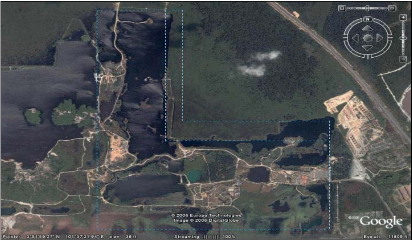
Figure 1.3: Aerial view of Paya Indah. Study area demarcated with dashed blue lines