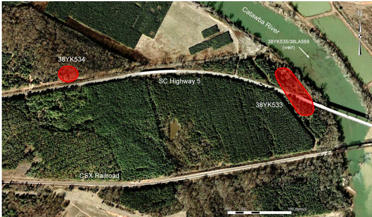
Figure 1.2. Aerial photograph taken March 30, 2004 of the project area, showing the locations of archaeological sites 38YK533 and 38YK534 in relation to SC Highway 5. Note the prehistoric fish weir (38YK535/38LA569) at the shoals in the river immediately northeast of 38YK533.