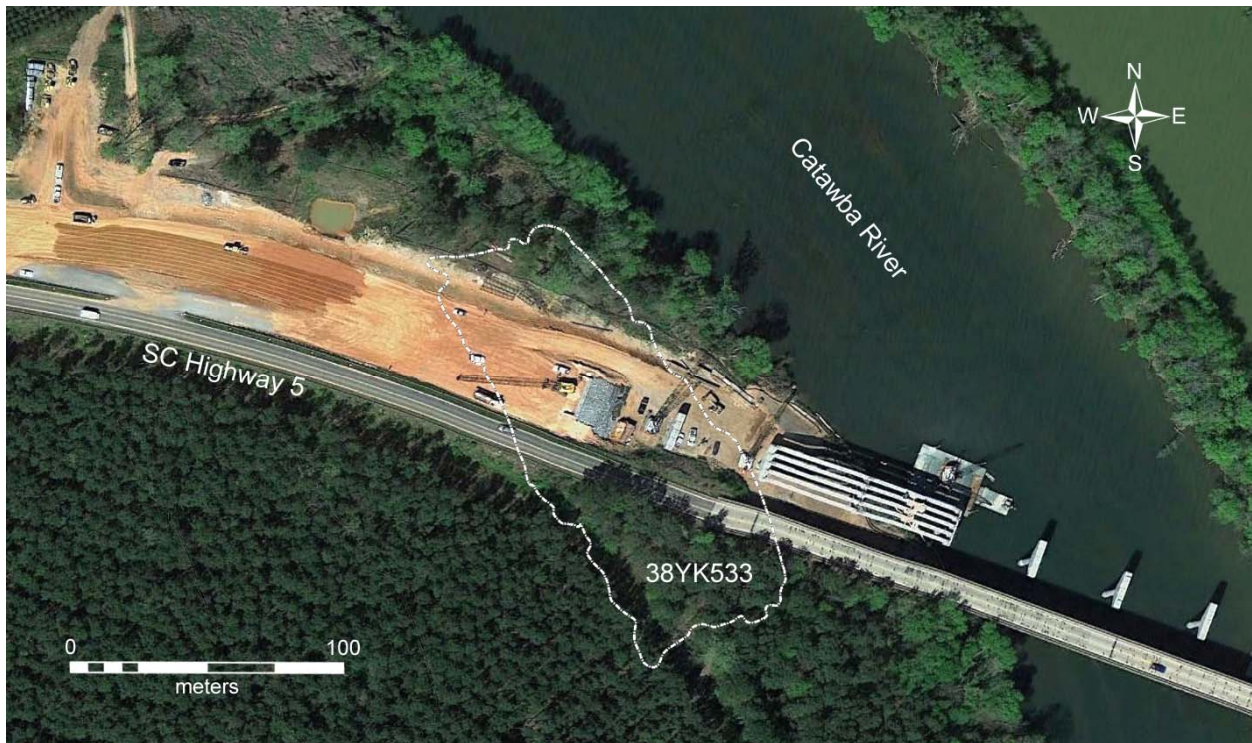
Figure 1.3. Aerial photograph taken March 26, 2012 of the project area, showing the locations of archaeological sites 38YK533 relative to new highway and bridge construction along SC Highway 5.