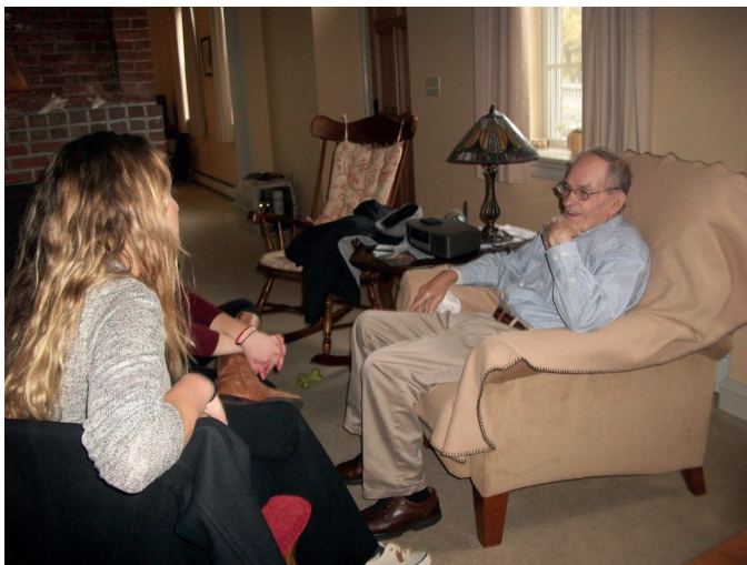
Figure 14.2 The occupational therapist collaborates with the client in his home to determine goals and intervention activities. She updates the client on his progress and changes goals as needed.

Personal rights, freedom, and autonomy are highly valued concepts and are consistent with client-centered care. The term self-determination refers to the client making decisions regarding personal health care. To make an informed decision, the client must be aware of the purpose of the intervention, including the possible risks and benefits. Practitioners are responsible for informing clients fully. Collaboration between the practitioner, the client, and family members is key. Collaboration is more than just choosing goals; it includes updates on progress, selection of intervention activities, and changes in goals as needed (Fig. 14.2). Collaboration is more difficult when working with