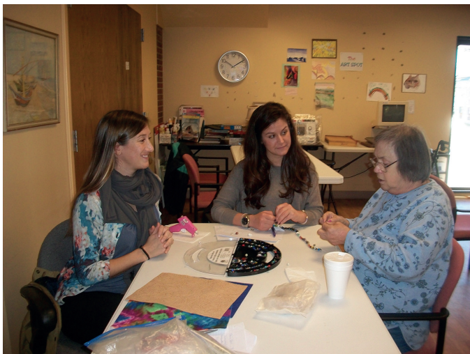
Figure 14.3 Two occupational therapy students engage a woman in an activity at the assisted living facility. The students clearly identify themselves as students and remind the woman that they are learning and appreciate her allowing them to spend time with her. They let her know that she may refuse to participate at any point. They ask the woman to give them feedback on the activity so they may learn from the experience. They answer her questions honestly and are supervised during the session.

Veracity refers to a duty to tell the truth and avoid deception (AOTA, 2020). Within working relationships, veracity is assumed and information conveyed is accepted as truthful. OT practitioners are obligated to communicate accurately and to make certain that the recipient clearly understands the message so they can make informed decisions. Veracity is an integral part of practice, research, and education leading to the development of trusting and productive relationships.