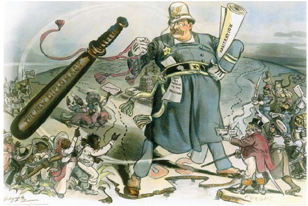
THE WORLD CONSTABLE