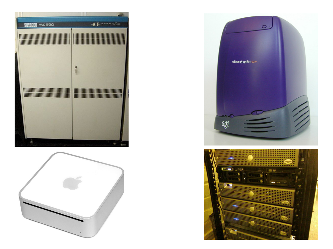
Figure 2.3: Different systems and architectures running Unix. A VAX-11 by DEC (VAX), an O2 by SGI (MIPS), a Mac Mini by Apple (PowerPC), PowerEdge servers by Dell (x86).

A system that allows multiple users to simultaneously utilize the given resources is in need of a security model that allows for a distinction of access levels or privileges. The system needs to be able to distinguish between file access or resource utilization amongst users, thus requiring the concept of access permissions, process and file ownership, process priorities and the like. Controlling access to shared resources by individual users also required, effectively, a single omnipotent user to control and administer these privileges, thus necessitating the superuser or root account (with plenty of security implications and concerns of its own).