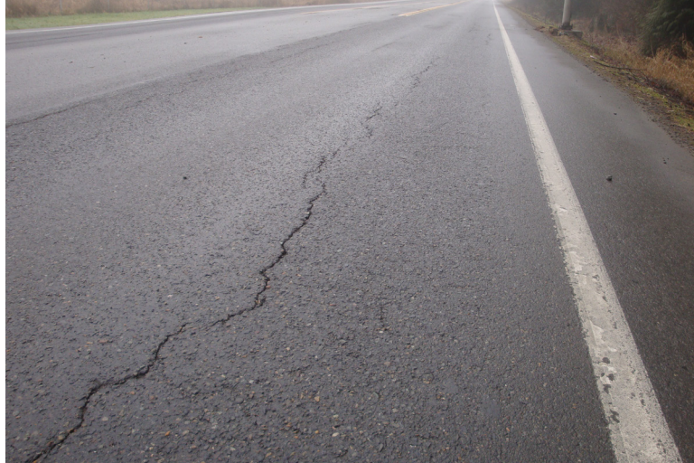
Exhibit 3-1 Longitudinal Cracking

This type of crack is usually a non-working crack that can be treated with a crack sealing material. It is highly recommended that these cracks are filled before getting to a width greater than a \frac{1}{2} inch to reduce sealant cost. Although this is the most cost-effective treatment option available, attempting to seal cracks that are greater than \frac{3}{4} inch is not recommended.