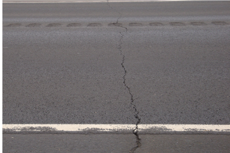
Exhibit 3-2 Transverse Cracking

Transverse cracks are most typically a working crack and sealing these cracks with a rubberized material is the most effective treatment option, although crack sealing is an alternative if a mastic material is used.