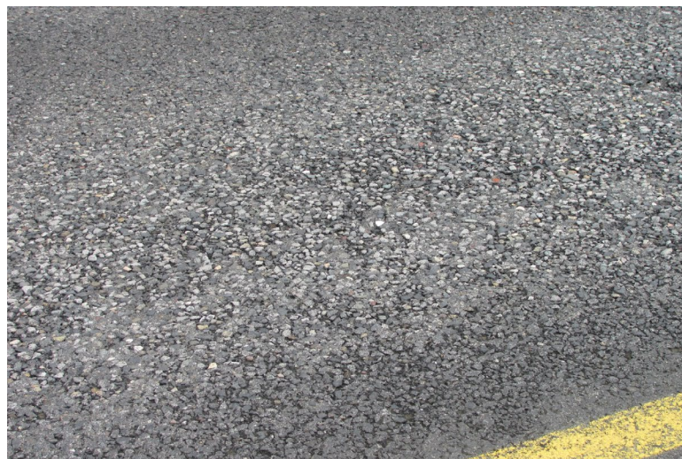
Exhibit 3-5 Raveling and Pitting

The best treatment option for a pavement that is raveling or pitting is to perform a fog seal to ensure the pavement has been sealed and thereby reduce the rapid deterioration usually exhibited from this distress. If raveling becomes severe a chip seal is an alternative.