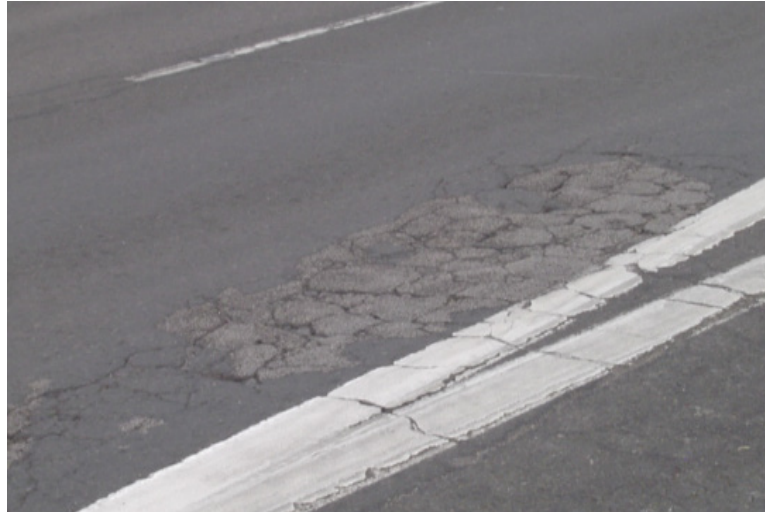
Exhibit 3-3 Alligator Cracking

If the alligator cracking isn't extensive, subgrade material isn't visible and signs of depressed pavement isn't present, a chip seal might be a possibility. The typical repair method, however; is to complete a partial-depth or full-depth patch. Full-depth cracking extends through the entire pavement structure, whereas partial-depth cracking goes through a portion of the pavement.