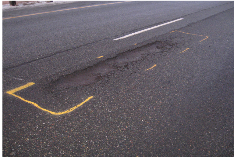
Exhibit 3-4 Potholes

Pothole repairs will generally be full-depth patches but care should be taken to confirm that they are full-depth. The repair area will always need to extend beyond the limit of the visible distress in order to get to sound material. If repairs only include the affected area, reoccurring distresses typically result.