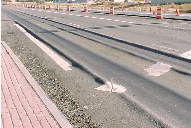
Exhibit 3-7 Rutting

There are a few options available to address this type of roadway distress. Rut filling with HMA is the most widely used, however; a second rut filling option is to utilize chip seal materials. Grinding of rutting can also occur but care must be taken to ensure this option will remove ruts until preservation occurs.