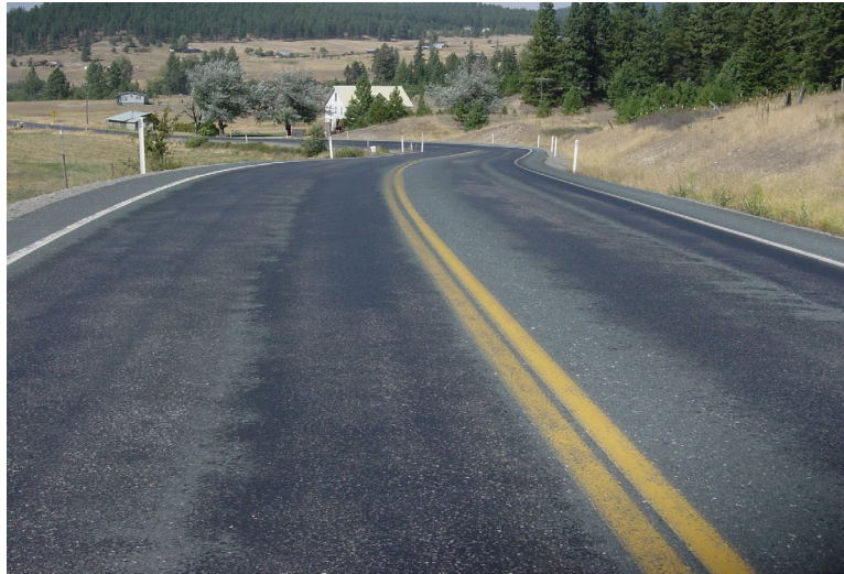
Exhibit 3-6 Flushing

Removal and replacement of flushed or bleeding pavement areas is an expensive, but sometimes cost-effective method of repair. Another option is to perform a chip seal with minimal or no emulsion but this approach necessitates proper prior planning. If repairs are not possible prior to a seasonally wet period, contact the regional traffic engineer to evaluate friction and the need for posting "Slippery When Wet" signs.