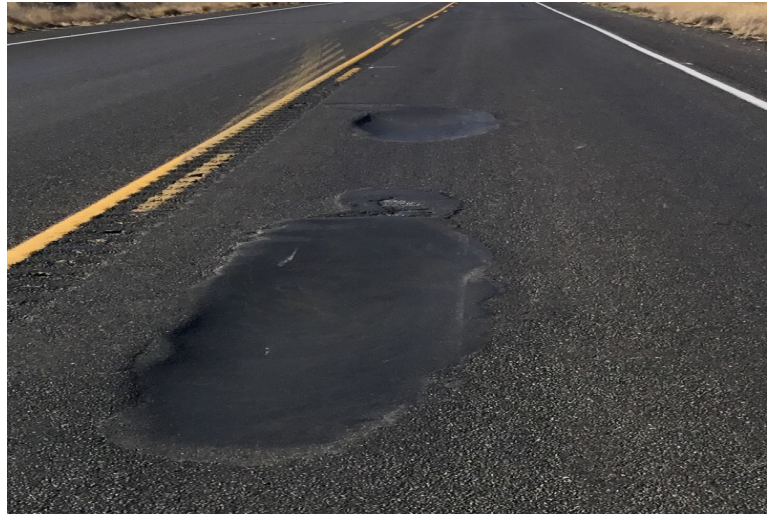
Exhibit 3-8 Sags and Humps

This distress typically results in full-depth repairs although a partial-depth patch or a micro-grind may be used depending on the cause of the distress.