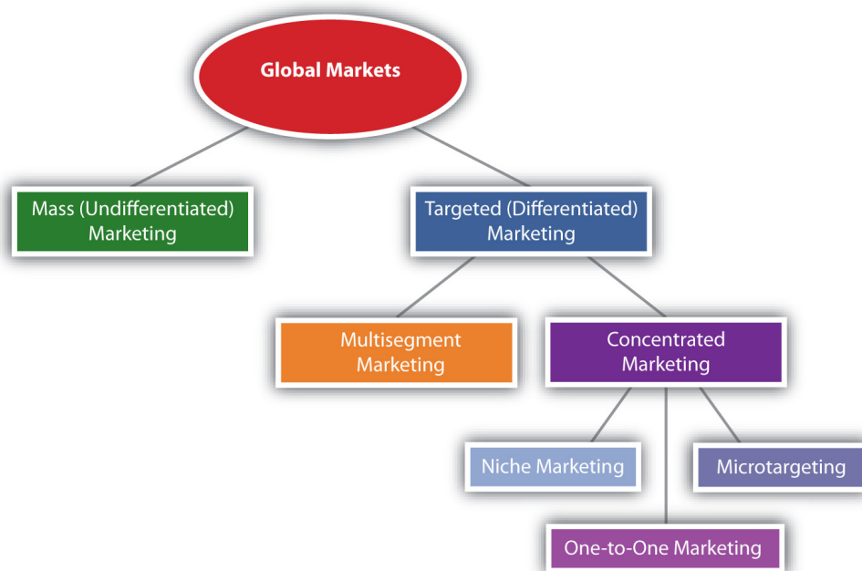
Figure 5.9 Targeting Strategies Used in Global Markets

Most companies, however, tailor their offerings to some extent to meet the needs of different buyers around the world. For example, Mattel sells Barbie dolls all around the world—but not the same Barbie. Mattel has created thousands of different Barbie offerings designed to appeal to all kinds of people in different countries.