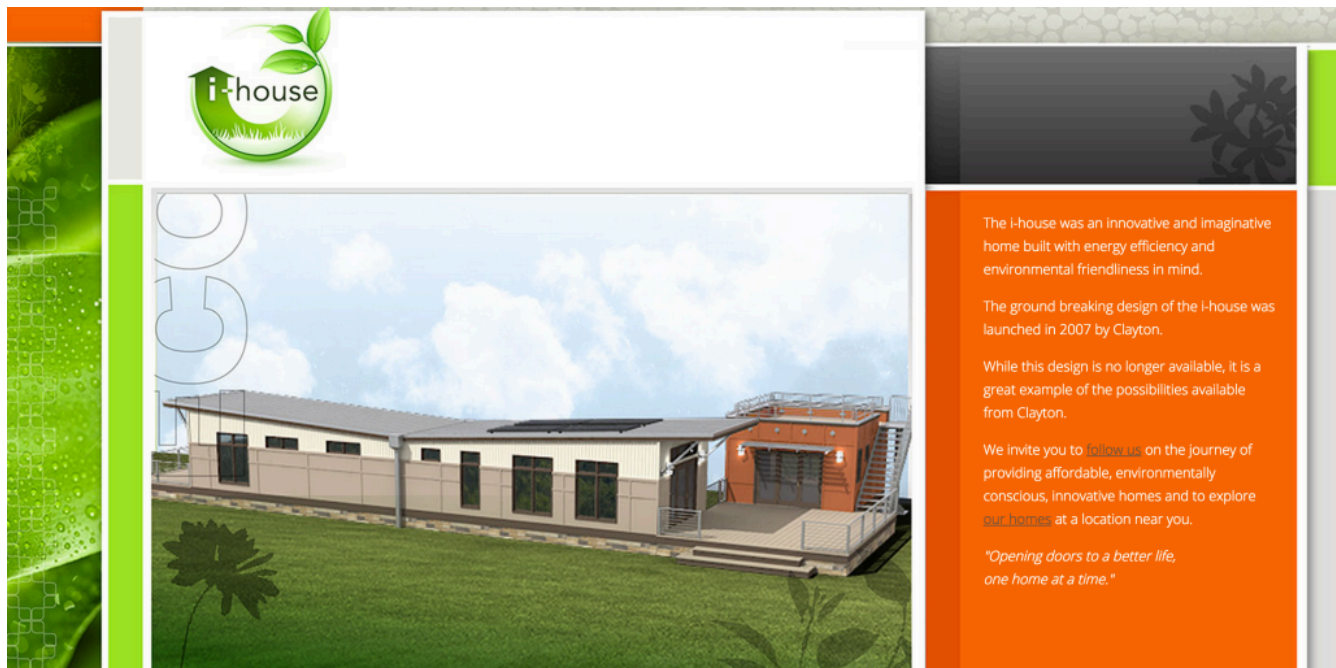
Figure 5.11 The Clayton i-house: “A Giant Leap from the Trailer Park”

a new market? I would think we are maintaining our value to our existing market and expanding the market to include other buyers that previously wouldn't have considered our housing product 1 .”