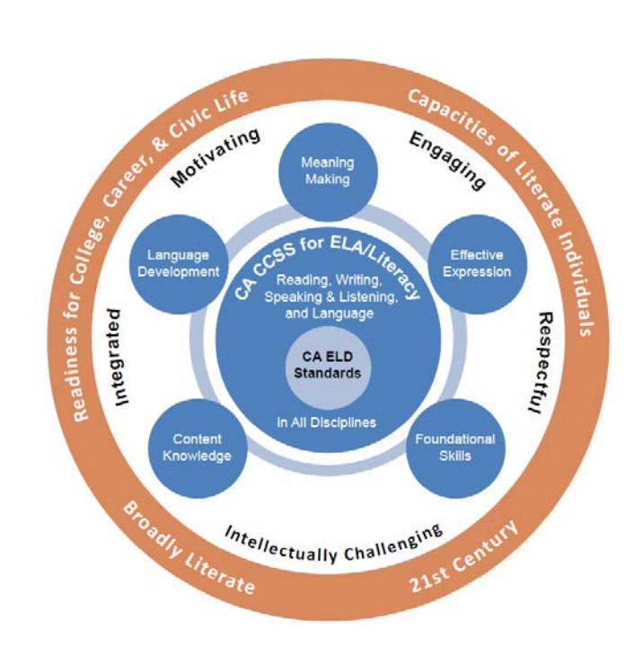
Figure 9.1. Goals, Context, and Themes of the CA CCSS for ELA/Literacy and the CA ELD Standards

The United States Department of Education's Strategic Plan for Fiscal Years 2011-2014 (<a href="http://www2.ed.gov/about/reports/strat/plan2011-14/draft-strategic-plan.pdf">http://www2.ed.gov/about/reports/strat/plan2011-14/draft-strategic-plan.pdf</a>) highlights the need to strive for equity in U.S. schools: